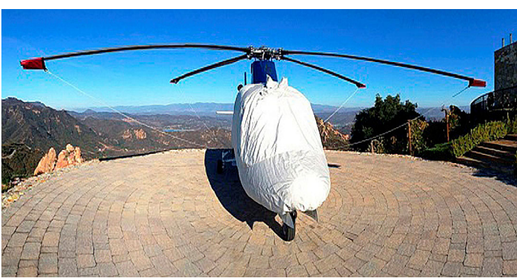
Agusta 109 Mk II+ Bubble Cover and Blade Tie-downs