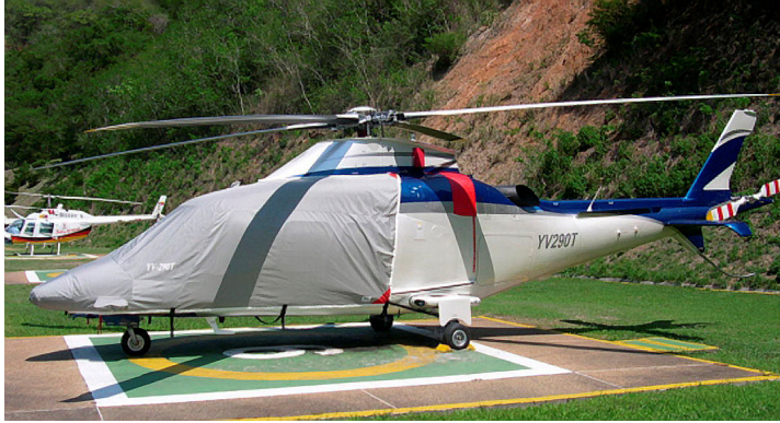
Agusta Grand Bubble Cover

Travel Covers are made with Silver Solution-Dyed Polyester fabric and fully lined over the entire cover. The material is lightweight and more compact for easy stowage in the aircraft. The polyester material is water resistant, but only intended for occasional use outside. We also have an ultra lightweight material available for fitted hangar dust covers. For daily outdoor use, the non-travel Sunbrella Cover is the best choice.