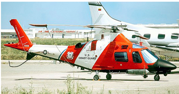
Covers, Plugs, HeatShields and related items for the Agusta MH-68A

Cabin Heatshields are interior sunshades for the aircraft's passenger cabin area. The product is a unique composite of closed-cell foam with a silver mylar finish. The semi-rigid design is stiff enough to stand inside the window framing. The set folds up flat and is easily stored in the included storage sleeve. Some designs may require velcro and suction cups. A Heatshield is an excellent short-term remedy for cockpit overheating, but an external fabric cover is more effective for long-term protection.