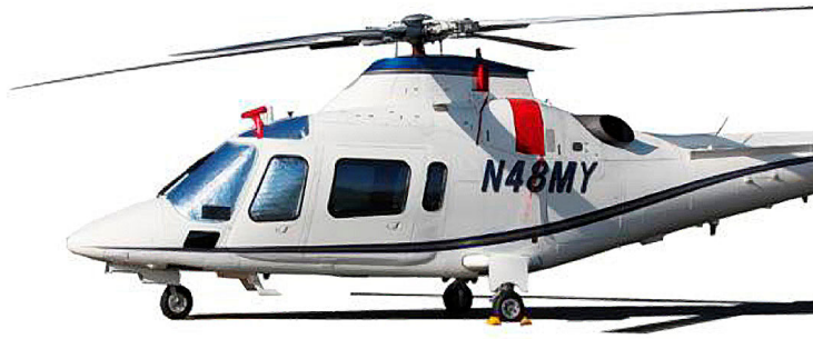
Agusta Power Pitot Covers, Intake Covers, and Cockpit Heatshield set