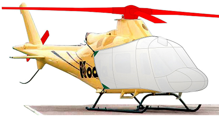
Koala Bubble, Rotor Hub, Blade & Tail Rotor Covers (illustration)