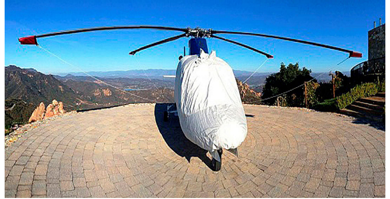
Agusta 109 Mk II+ Bubble Cover and Blade Tie-downs