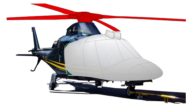
Agusta 109 Bubble, Rotor Hub & Blade Covers (illustration)

WINTER USE MATERIAL - Made with Solution-Dyed Polyester fabric, this option is intended for seasonal use to aid in deicing, rain mitigation, or for occasional travel. The material is lighter and more compact, but more susceptible to UV damage and may have a shorter useful life if used continuously outside than the all-year use material.