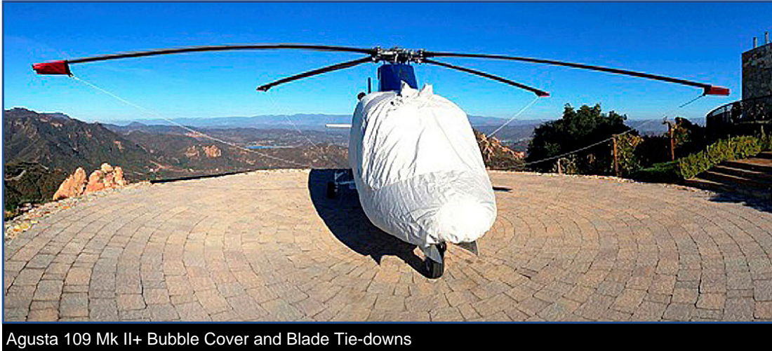
Agusta 109 Mk II+ Bubble Cover and Blade Tie-downs