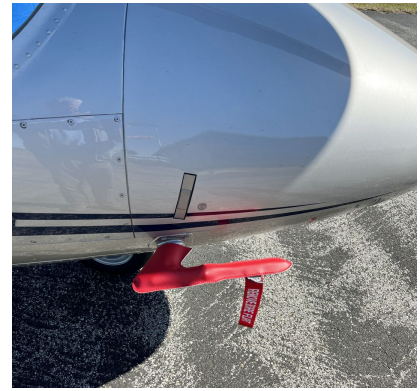
Agusta AW109 (A, C, & Trekker) Pitot Cover Set