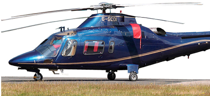
Agusta Power Intake Cover

WINTER USE MATERIAL - Made with Solution-Dyed Polyester fabric, this option is intended for seasonal use to aid in deicing, rain mitigation, or for occasional travel. The material is lighter and more compact, but more susceptible to UV damage and may have a shorter useful life if used continuously outside than the all-year use material.