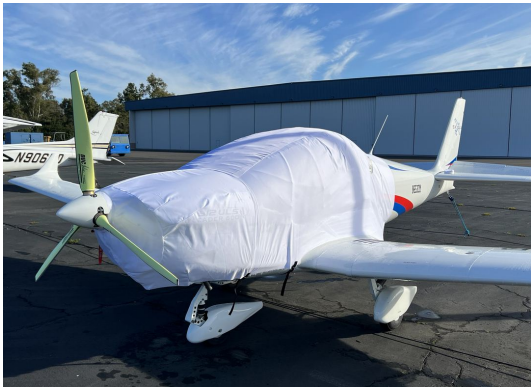
Jihlavan JA-600 Skyleader Extended Canopy/Engine Cover, test fit cover

This cover type is made from Silver Acrylic Sunbrella canvas and is 100% lined with a soft and smooth microfiber. Bruce's Custom Covers developed this material combination especially for aircraft protection. The outer material is medium weight and treated for water resistance, UV resistance and anti-static buildup. The inner lining is a very soft and smooth microfiber to prevent scratching. The material is very reflective, and tests show that the cabin interior temperature can be reduced to near-ambient temperature on the hottest of days. It is water, ice and snow repellent, yet breathable to allow moisture to escape from between the cover and the aircraft surface.