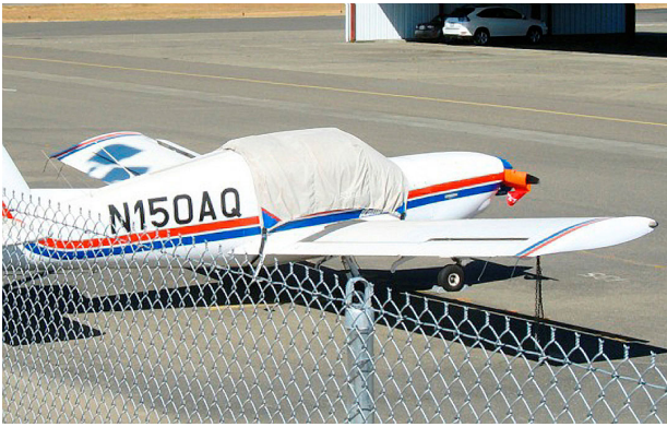
Koliber 150-A Canopy Cover