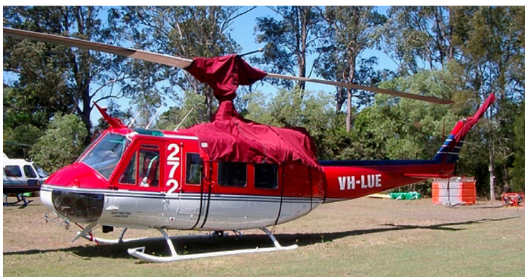
Bell 204/205 Engine/Mid-Cabin Cover, Main & Tail Rotor Covers