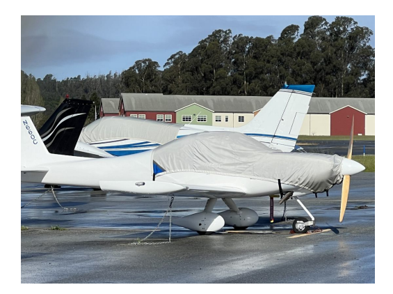
KIS 2-Place Canopy/Engine Cover

reflective, and tests show that the cabin interior temperature can be reduced to near-ambient temperature on the hottest of days. It is water, ice and snow repellent, yet breathable to allow moisture to escape from between the cover and the aircraft surface.