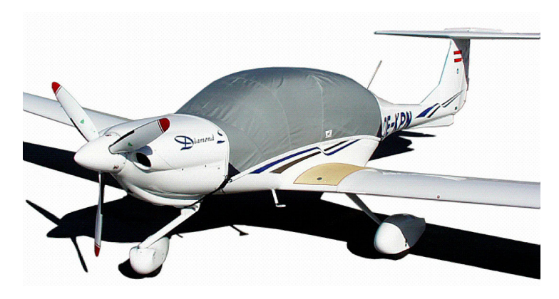
Diamond DA40 Standard Canopy Cover