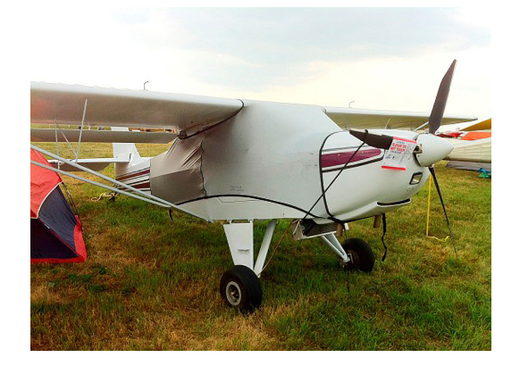
Kitfox Spandex FlyAway Travel Canopy Cover

Travel Covers are made with Silver Solution-Dyed Polyester fabric and only lined over the windshield to save weight. The material is lightweight and more compact for easy stowage in the aircraft. The polyester material is water resistant, but only intended for occasional use outside. We also have an ultra lightweight material available for fitted hangar dust covers. For daily outdoor use, the non-travel Sunbrella Cover is the best choice.