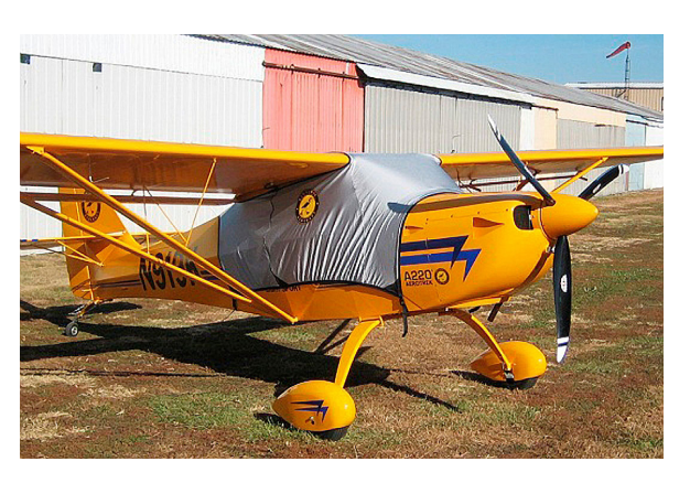
Aerotrek A220 Fitted Hangar Dust Cover