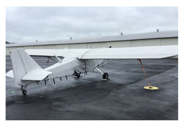
Kitfox 5 Complete Cover Set