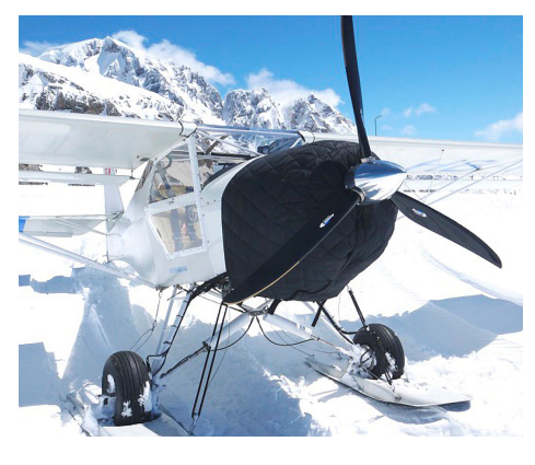
Kitfox Insulated Engine Cover

This cover type is made from Silver Acrylic Sunbrella canvas and is 100% lined with a soft and smooth microfiber. Bruce's Custom Covers developed this material combination especially for aircraft protection. The outer material is medium weight and treated for water resistance, UV resistance and anti-static buildup. The inner lining is a very soft and smooth microfiber to prevent scratching. The material is very reflective, and tests show that the cabin interior temperature can be reduced to near-ambient temperature on the hottest of days. It is water, ice and snow repellent, yet breathable to allow moisture to escape from between the cover and the aircraft surface.