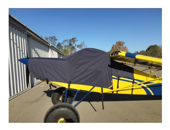
Just Highlander Trailering Covers, set of 2

Eurofox Canopy, Engine, Wings and Empennage Covers