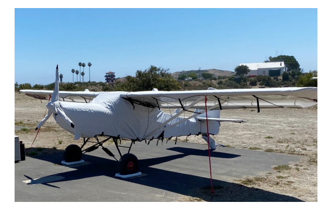
Kitfox Full Cover Set

ALL-YEAR USE MATERIAL - Made with Silver Acrylic Sunbrella canvas, the all-year use material is the best option for sun protection and cover longevity. This heavier more durable material is intended for all weather conditions, such as rain and snow or lots of sun.