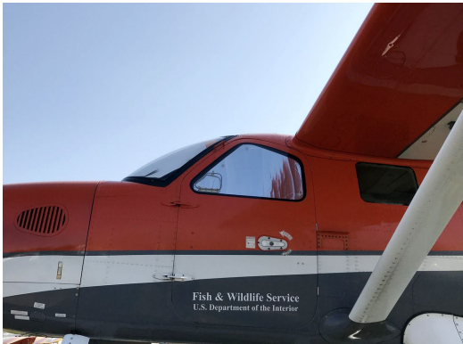
Quest Kodiak Cockpit HeatShields

Cockpit Heatshields are interior sunshades for the aircraft's cockpit. The product is a unique composite of closed-cell foam with a silver mylar finish. The semi-rigid design is stiff enough to stand inside the window framing. The set folds up flat and is easily stored in the included storage sleeve. Some designs may require velcro and suction cups. A Heatshield is an excellent short-term remedy for cockpit overheating, but an external fabric cover is more effective for long-term protection.