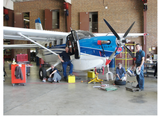
Quest Kodiak Prop Tie/Exhaust Covers, Engine Inlet Plugs & Pitot Cover