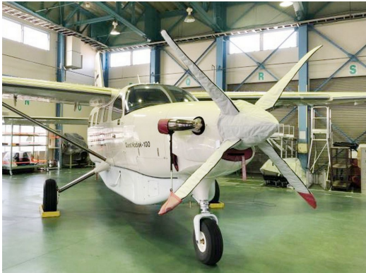
Quest Aircraft Kodiak Insulated Propellor/Spinner Cover, 4 Blade