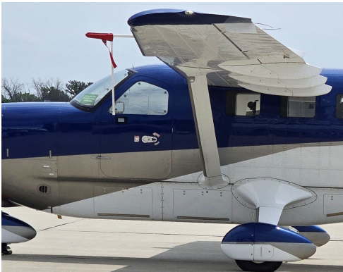
Quest Aircraft Kodiak Cockpit Heatshields