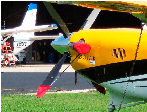
Quest Kodiak Prop Tie/Exhaust Covers

water resistance, UV resistance and anti-static buildup. The inner lining is a very soft and smooth microfiber to prevent scratching. The material is very reflective, and tests show that the cabin interior temperature can be reduced to near-ambient temperature on the hottest of days. It is water, ice and snow repellent, yet breathable to allow moisture to escape from between the cover and the aircraft surface.