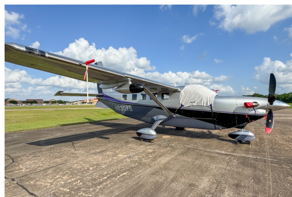
Kodiak 200 Cockpit Cover, Pitot Cover, Prop Tie/Exhaust Cover