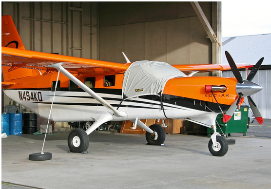
Quest Kodiak Windshield Cover, Prop Tie/Exhaust Covers, Engine Inlet Plugs & Pitot Cover

This cover type is made from Silver Acrylic Sunbrella canvas and is 100% lined with a soft and smooth microfiber. Bruce's Custom Covers developed this material combination especially for aircraft protection. The outer material is medium weight and treated for water resistance, UV resistance and anti-static buildup. The inner lining is a very soft and smooth microfiber to prevent scratching. The material is very reflective, and tests show that the cabin interior temperature can be reduced to near-ambient temperature on the hottest of days. It is water, ice and snow repellent, yet breathable to allow moisture to escape from between the cover and the aircraft surface.