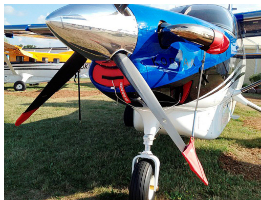
Quest Kodiak Prop Tie, Exhaust Covers, Intake Plug Quest Kodiak Prop Tie/Exhaust Covers, Engine Inlet Plugs & Pitot Covers