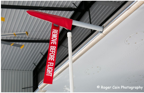
Quest Kodiak Pitot Cover with fixed PVC handle