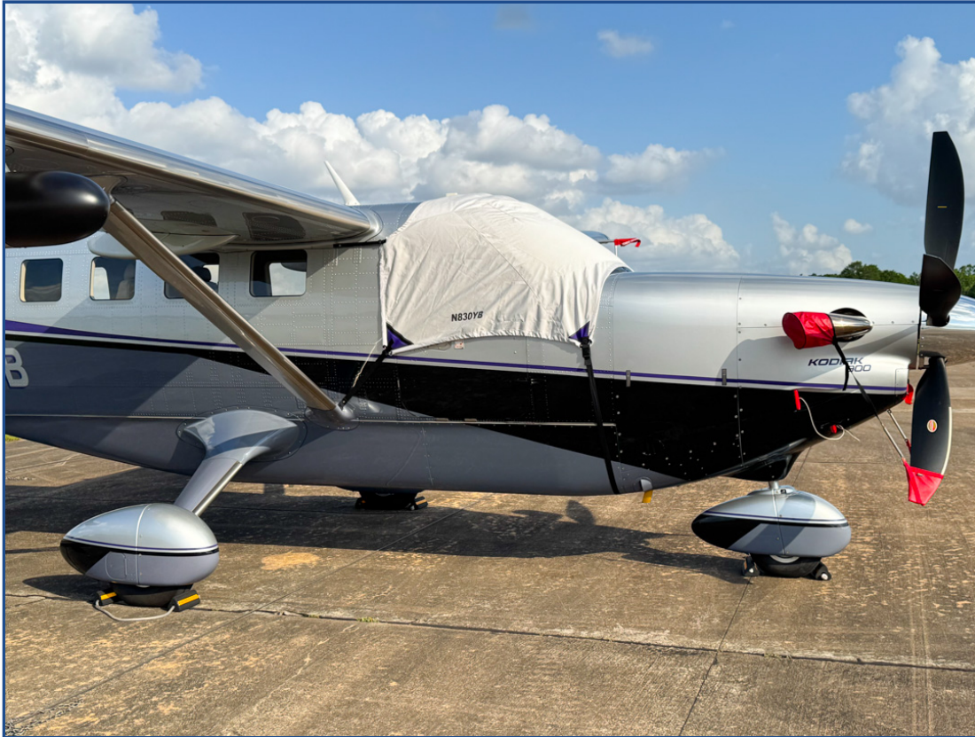
Kodiak Aircraft Co Inc KODIAK 200 Cockpit Cover