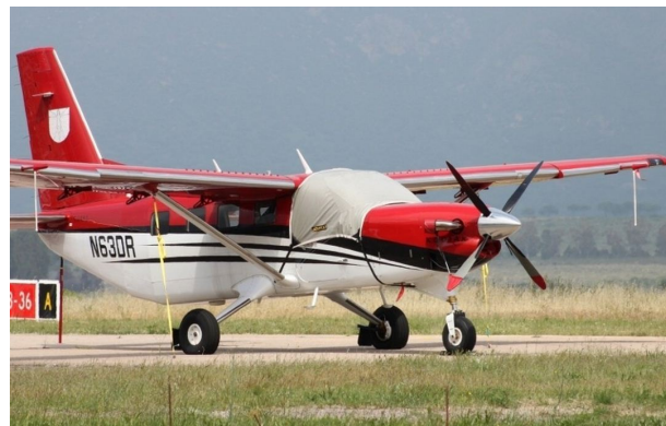
Quest Kodiak Cockpit Cover, Engine Plugs, Prop Tie/Exhaust Covers, & Cabin HeatShields set