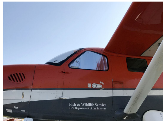
Quest Kodiak Cockpit HeatShields