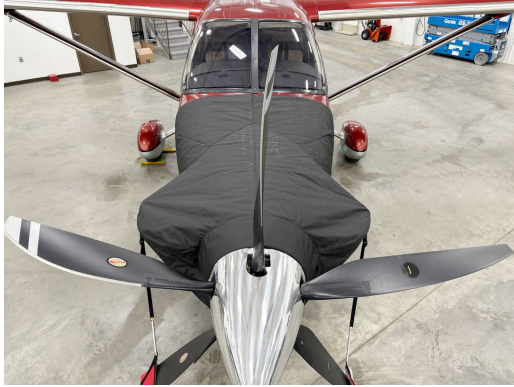
Quest Kodiak Insulated Engine Cover w/Prop Ties, Nose Wheel Cover (padded)

water resistance, UV resistance and anti-static buildup. The inner lining is a very soft and smooth microfiber to prevent scratching. The material is very reflective, and tests show that the cabin interior temperature can be reduced to near-ambient temperature on the hottest of days. It is water, ice and snow repellent, yet breathable to allow moisture to escape from between the cover and the aircraft surface.