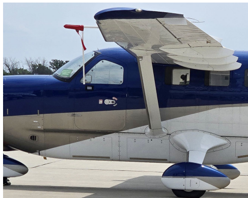
Quest Aircraft Kodiak Cockpit Heatshields

Cockpit Heatshields are interior sunshades for the aircraft's cockpit. The product is a unique composite of closed-cell foam with a silver mylar finish. The semi-rigid design is stiff enough to stand inside the window framing. The set folds up flat and is easily stored in the included storage sleeve. Some designs may require velcro and suction cups. A Heatshield is an excellent short-term remedy for cockpit overheating, but an external fabric cover is more effective for long-term protection.