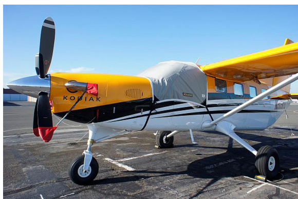
Quest Kodiak Cockpit Cover, Engine Plugs, Prop Tie/Exhaust Covers, & Cabin HeatShields set

This cover type is made from Silver Acrylic Sunbrella canvas and is 100% lined with a soft and smooth microfiber. Bruce's Custom Covers developed this material combination especially for aircraft protection. The outer material is medium weight and treated for water resistance, UV resistance and anti-static buildup. The inner lining is a very soft and smooth microfiber to prevent scratching. The material is very reflective, and tests show that the cabin interior temperature can be reduced to near-ambient temperature on the hottest of days. It is water, ice and snow repellent, yet breathable to allow moisture to escape from between the cover and the aircraft surface.