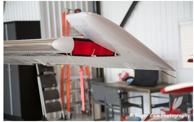
Quest Kodiak Horizontal Stabilizer Lightning Holes Plugs