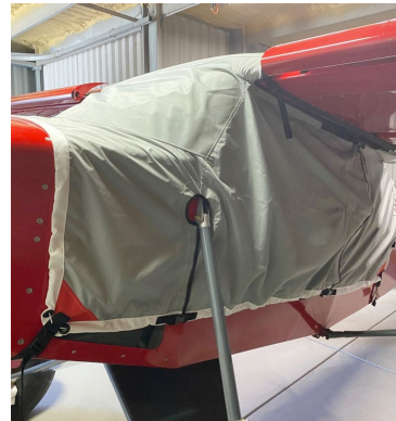
Just SuperSTOL Travel Canopy Cover