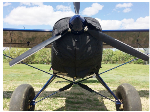
Just Aircraft Highlander Insulated Engine Cover