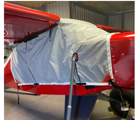
Just SuperSTOL Travel Canopy Cover