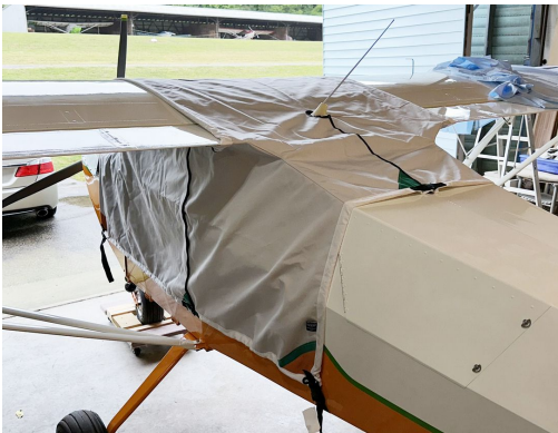
Just Highlander Canopy Cover