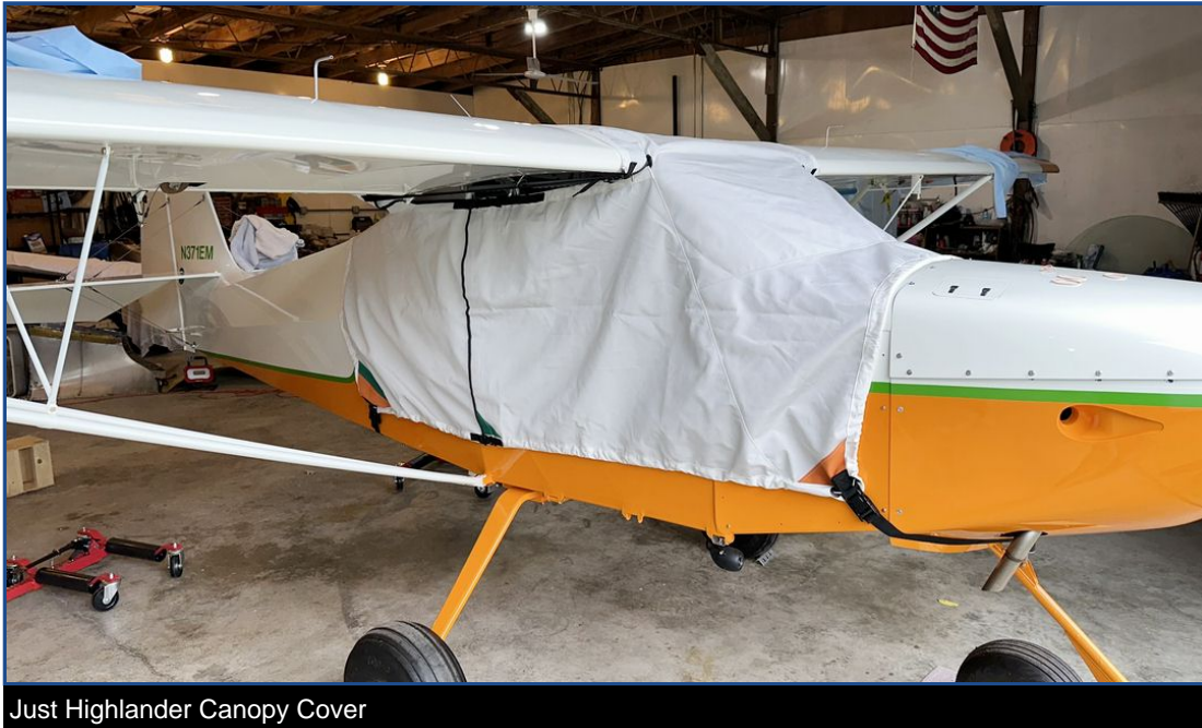
Just Highlander Canopy Cover