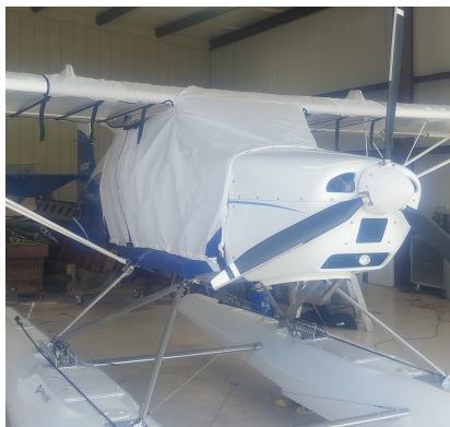
Just Highlander Canopy Cover, extends to cover gas caps

This cover type is made from Silver Acrylic Sunbrella canvas and is 100% lined with a soft and smooth microfiber. Bruce's Custom Covers developed this material combination especially for aircraft protection. The outer material is medium weight and treated for water resistance, UV resistance and anti-static buildup. The inner lining is a very soft and smooth microfiber to prevent scratching. The material is very reflective, and tests show that the cabin interior temperature can be reduced to near-ambient temperature on the hottest of days. It is water, ice and snow repellent, yet breathable to allow moisture to escape from between the cover and the aircraft surface.