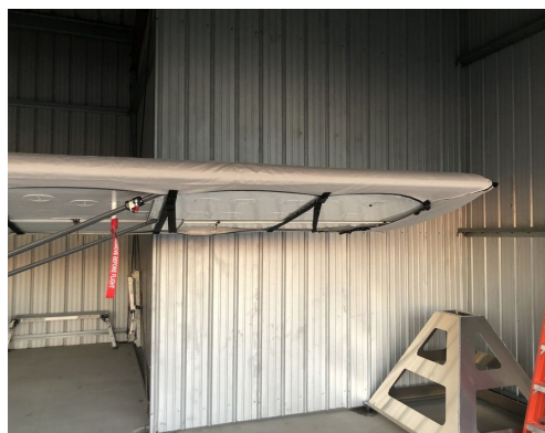
Just JA30 SuperSTOL Wing Covers