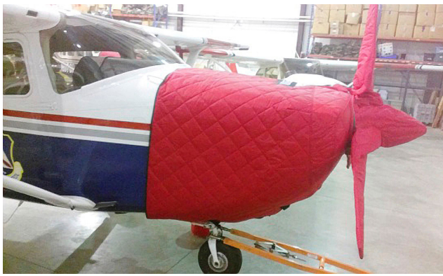
Cessna 182 Insulated Engine & Prop Covers (3-blade)