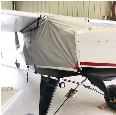
Just Highlander Canopy Cover, Travel Type

This cover type is made from Silver Acrylic Sunbrella canvas and is 100% lined with a soft and smooth microfiber. Bruce's Custom Covers developed this material combination especially for aircraft protection. The outer material is medium weight and treated for water resistance, UV resistance and anti-static buildup. The inner lining is a very soft and smooth microfiber to prevent scratching. The material is very reflective, and tests show that the cabin interior temperature can be reduced to near-ambient temperature on the hottest of days. It is water, ice and snow repellent, yet breathable to allow moisture to escape from between the cover and the aircraft surface.