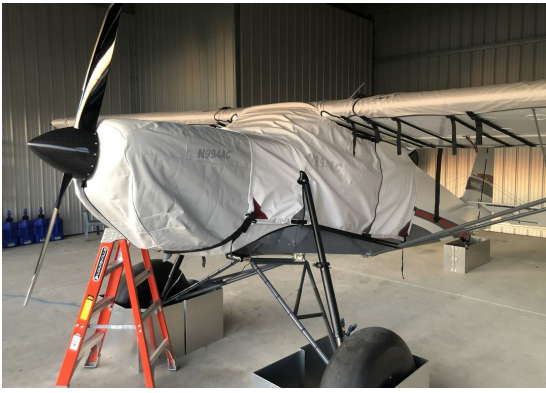
Just JA30 SuperSTOL Cover Set