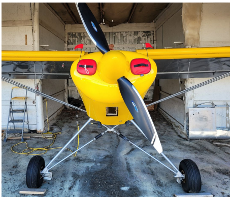
Preceptor STOL King Engine Plugs

Engine Inlet Plugs are custom fit for your Just Aircraft Highlander, Escapade, Super STOL intakes, made with heavy-duty vinyl material, and stuffed with a single block of sculpted urethane foam. Each plug has a zipper that allows the foam to be removed and dried if necessary. Engine plugs have warning flags that are visible from the cockpit or 'remove before flight' streamers sewn onto the face of the plugs. Most plugs are imprinted with the aircraft registration number in black for an extra charge. Storage bag NOT included. Engine plugs may be inserted after flight when the engine is still warm. Engine Inlet Plugs are commonly referred to as Cowl Plugs, Intake Plugs, Cowl Blocks, Engine Blocks, and Engine Bungs.