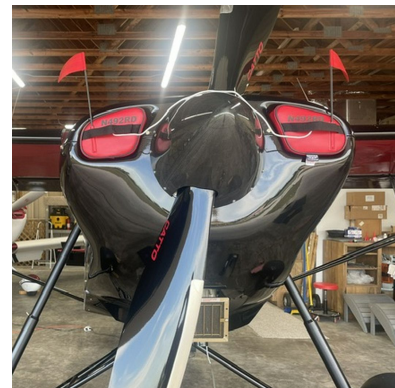
Just Aircraft JA35 SUPERSTOL Engine Inlet Plugs