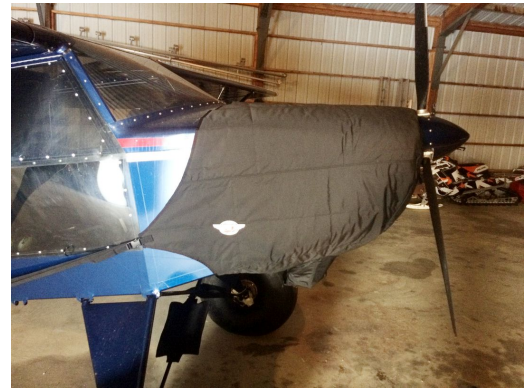
Just Highlander Insulated Engine Cover