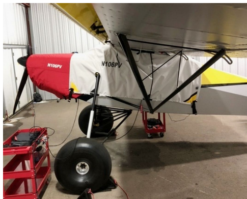
Just Aircraft JA30 Superstol Over The Top Style Canopy Cover, Insulated Engine Cover