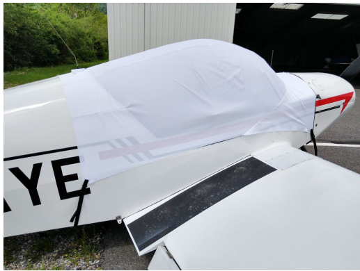
Jodel D113V Canopy Cover, test fit cover

the hottest of days. It is water, ice and snow repellent, yet breathable to allow moisture to escape from between the cover and the aircraft surface.