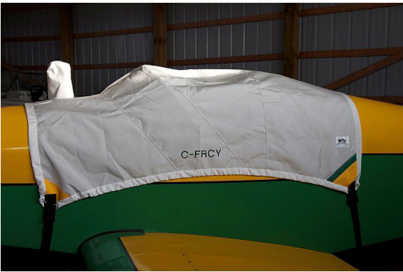
Jodel D9 Bebe Canopy Cover