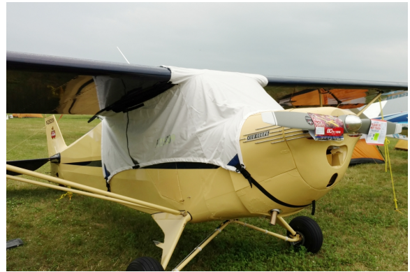
Piper J-4 Cub Coupe Canopy Cover (Over-Top)