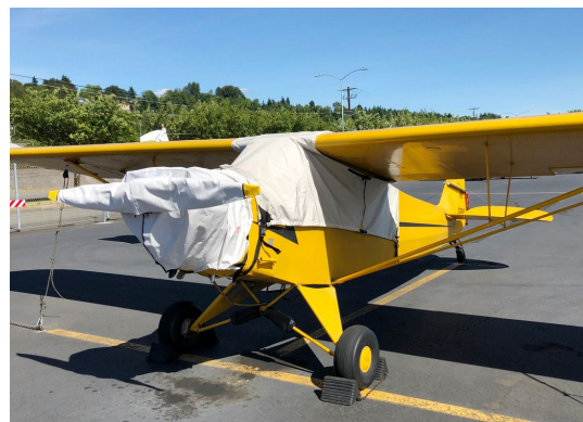
Piper J3C-65 Engine Cover (open on bottom)