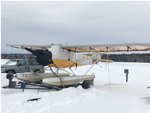
Piper J3 Cub Extended Canopy, Wings, Empennage & Insulated Engine Covers

WINTER USE MATERIAL - Made with Solution-Dyed Polyester fabric, this option is intended for seasonal use to aid in deicing, rain mitigation, or for occasional travel. The material is lighter and more compact, but more susceptible to UV damage and may have a shorter useful life if used continuously outside than the all-year use material.