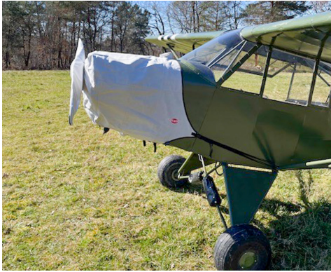
Piper J-3 Cub & L-4 Prop & Engine Cover