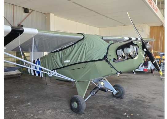
Piper L-4 Travel Canopy Cover, over-top type