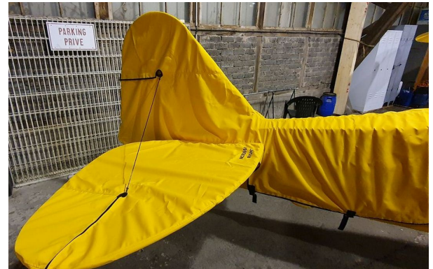
Piper J3 Empennage Cover