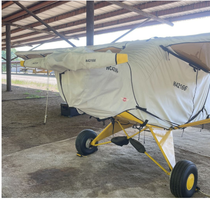
Piper J-3C-65 Cub Engine Cover, Fully Enclosed