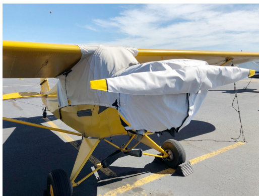
Piper J3C-65 Propellor Cover (np spinner)

This cover type is made from Silver Acrylic Sunbrella canvas and is 100% lined with a soft and smooth microfiber. Bruce's Custom Covers developed this material combination especially for aircraft protection. The outer material is medium weight and treated for water resistance, UV resistance and anti-static buildup. The inner lining is a very soft and smooth microfiber to prevent scratching. The material is very reflective, and tests show that the cabin interior temperature can be reduced to near-ambient temperature on the hottest of days. It is water, ice and snow repellent, yet breathable to allow moisture to escape from between the cover and the aircraft surface.