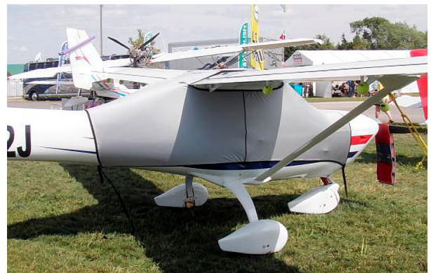
Jabiru Spandex FlyAway Travel Canopy Cover