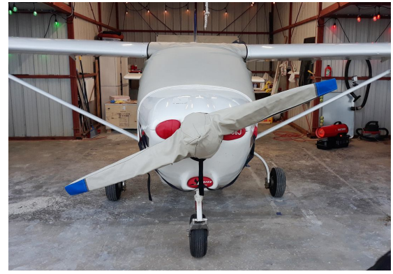
Jabiru J250 Canopy & Prop Cover