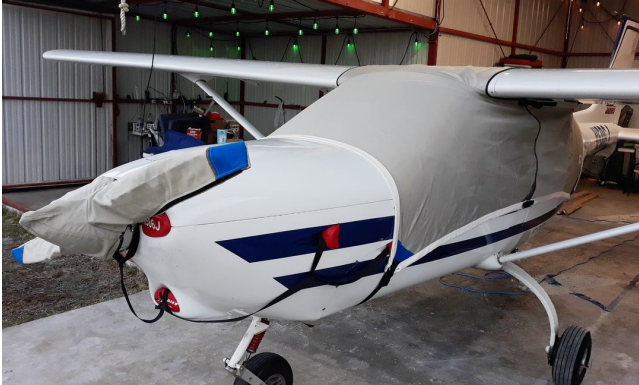
Jabiru J250 Canopy & Prop Cover

This cover type is made from Silver Acrylic Sunbrella canvas and is 100% lined with a soft and smooth microfiber. Bruce's Custom Covers developed this material combination especially for aircraft protection. The outer material is medium weight and treated for water resistance, UV resistance and anti-static buildup. The inner lining is a very soft and smooth microfiber to prevent scratching. The material is very reflective, and tests show that the cabin interior temperature can be reduced to near-ambient temperature on the hottest of days. It is water, ice and snow repellent, yet breathable to allow moisture to escape from between the cover and the aircraft surface.