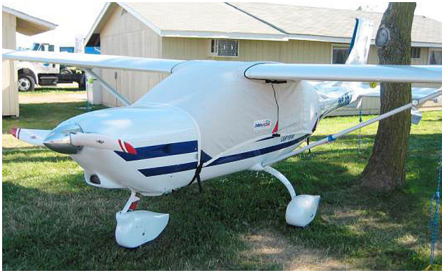
Jabiru 250 Standard Canopy Cover