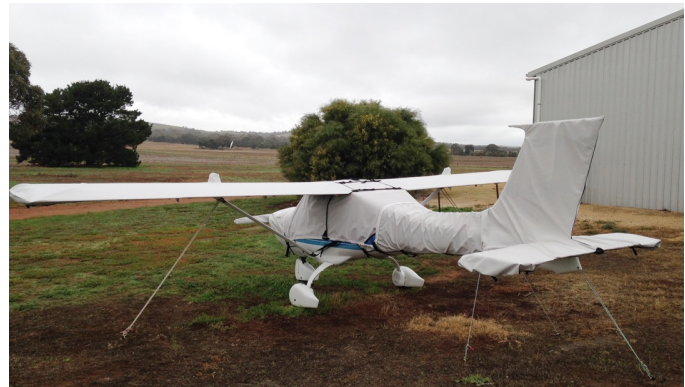
Jabiru 160 Canopy, Engine, Prop, Wings & Empennage Covers