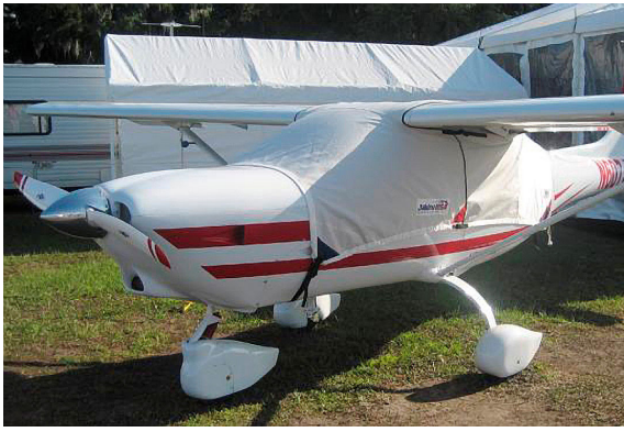
Jabiru 230-SP Canopy Cover, Over-top style