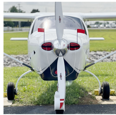
Jabiru J230-SP Engine Inlet Plugs