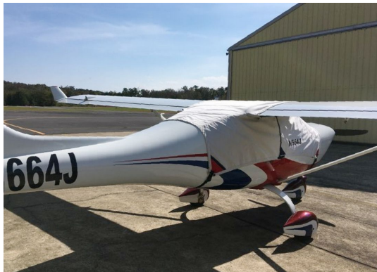
Jabiru J230-SP Canopy Cover, Over-Top Style

This cover type is made from Silver Acrylic Sunbrella canvas and is 100% lined with a soft and smooth microfiber. Bruce's Custom Covers developed this material combination especially for aircraft protection. The outer material is medium weight and treated for water resistance, UV resistance and anti-static buildup. The inner lining is a very soft and smooth microfiber to prevent scratching. The material is very reflective, and tests show that the cabin interior temperature can be reduced to near-ambient temperature on the hottest of days. It is water, ice and snow repellent, yet breathable to allow moisture to escape from between the cover and the aircraft surface.