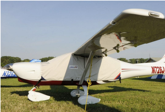
Jabiru J230 Extended Canopy Cover, over top type

This cover type is made from Silver Acrylic Sunbrella canvas and is 100% lined with a soft and smooth microfiber. Bruce's Custom Covers developed this material combination especially for aircraft protection. The outer material is medium weight and treated for water resistance, UV resistance and anti-static buildup. The inner lining is a very soft and smooth microfiber to prevent scratching. The material is very reflective, and tests show that the cabin interior temperature can be reduced to near-ambient temperature on the hottest of days. It is water, ice and snow repellent, yet breathable to allow moisture to escape from between the cover and the aircraft surface.