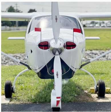
Jabiru J230-SP Engine Inlet Plugs