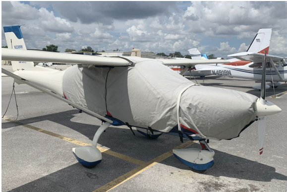
Jabiru 230D Extended Canopy Cover & Engine Covers

This cover type is made from Silver Acrylic Sunbrella canvas and is 100% lined with a soft and smooth microfiber. Bruce's Custom Covers developed this material combination especially for aircraft protection. The outer material is medium weight and treated for water resistance, UV resistance and anti-static buildup. The inner lining is a very soft and smooth microfiber to prevent scratching. The material is very reflective, and tests show that the cabin interior temperature can be reduced to near-ambient temperature on the hottest of days. It is water, ice and snow repellent, yet breathable to allow moisture to escape from between the cover and the aircraft surface.