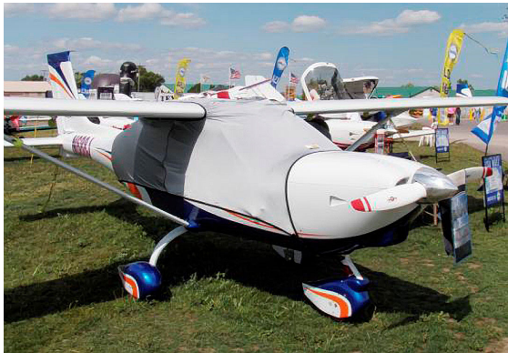
Jabiru Spandex FlyAway Travel Canopy Cover

Travel Covers are made with Silver Solution-Dyed Polyester fabric and only lined over the windshield to save weight. The material is lightweight and more compact for easy stowage in the aircraft. The polyester material is water resistant, but only intended for occasional use outside. We also have an ultra lightweight material available for fitted hangar dust covers. For daily outdoor use, the non-travel Sunbrella Cover is the best choice.