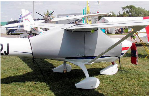
Jabiru Spandex FlyAway Travel Canopy Cover