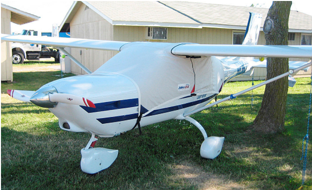
Jabiru 250 Standard Canopy Cover