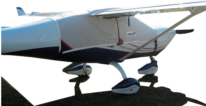
Jabiru 230-SP Canopy Cover, Over-top style

This cover type is made from Silver Acrylic Sunbrella canvas and is 100% lined with a soft and smooth microfiber. Bruce's Custom Covers developed this material combination especially for aircraft protection. The outer material is medium weight and treated for water resistance, UV resistance and anti-static buildup. The inner lining is a very soft and smooth microfiber to prevent scratching. The material is very reflective, and tests show that the cabin interior temperature can be reduced to near-ambient temperature on the hottest of days. It is water, ice and snow repellent, yet breathable to allow moisture to escape from between the cover and the aircraft surface.