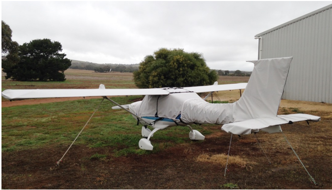
Jabiru 160 Canopy, Engine, Prop, Wings & Empennage Covers Jabiru 160 Canopy, Engine, Prop, Wings & Empennage Covers