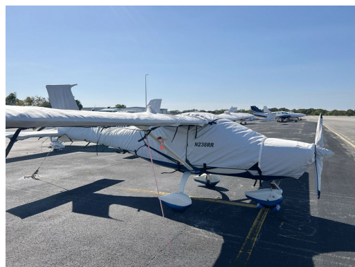
Jabiru 230D Complete Cover Set