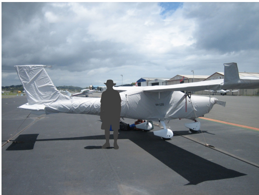
Jabiru J430 Complete Cover Set

This cover type is made from Silver Acrylic Sunbrella canvas and is 100% lined with a soft and smooth microfiber. Bruce's Custom Covers developed this material combination especially for aircraft protection. The outer material is medium weight and treated for water resistance, UV resistance and anti-static buildup. The inner lining is a very soft and smooth microfiber to prevent scratching. The material is very reflective, and tests show that the cabin interior temperature can be reduced to near-ambient temperature on the hottest of days. It is water, ice and snow repellent, yet breathable to allow moisture to escape from between the cover and the aircraft surface.