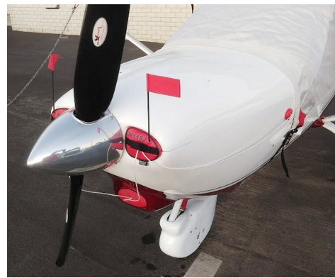
Jabiru 430 Engine Inlet Plugs