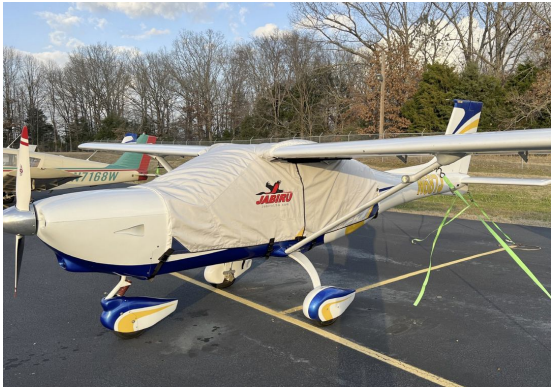
Jabiru J230-SP Extended Canopy Cover