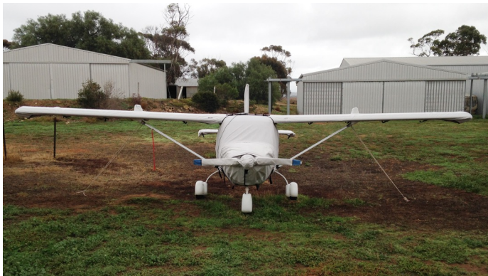
Jabiru 160 Canopy, Engine, Prop, Wings & Empennage Covers