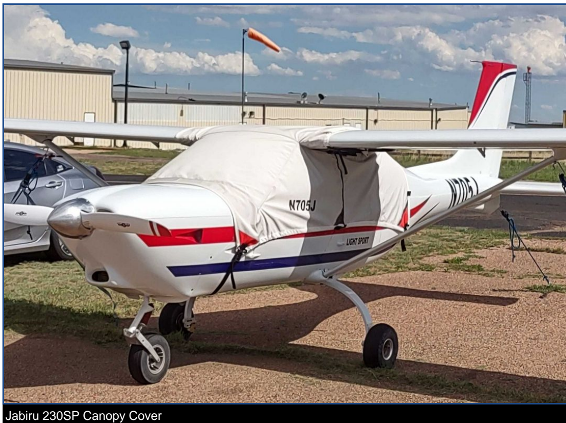
Jabiru 230SP Canopy Cover