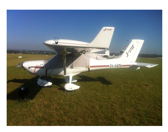
Jabiru 170 Canopy Cover