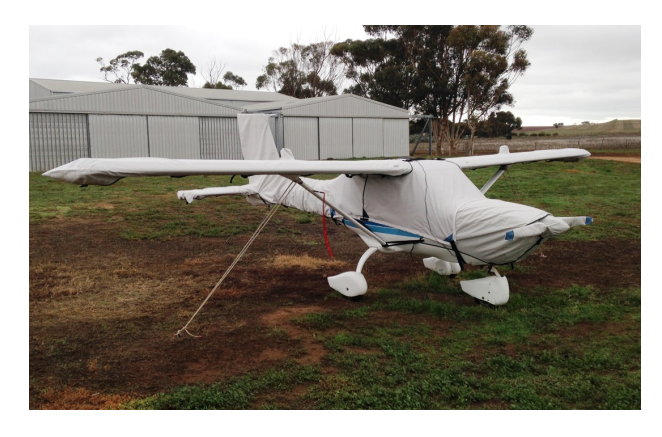
Jabiru 160 Canopy, Engine, Prop, Wings & Empennage Covers