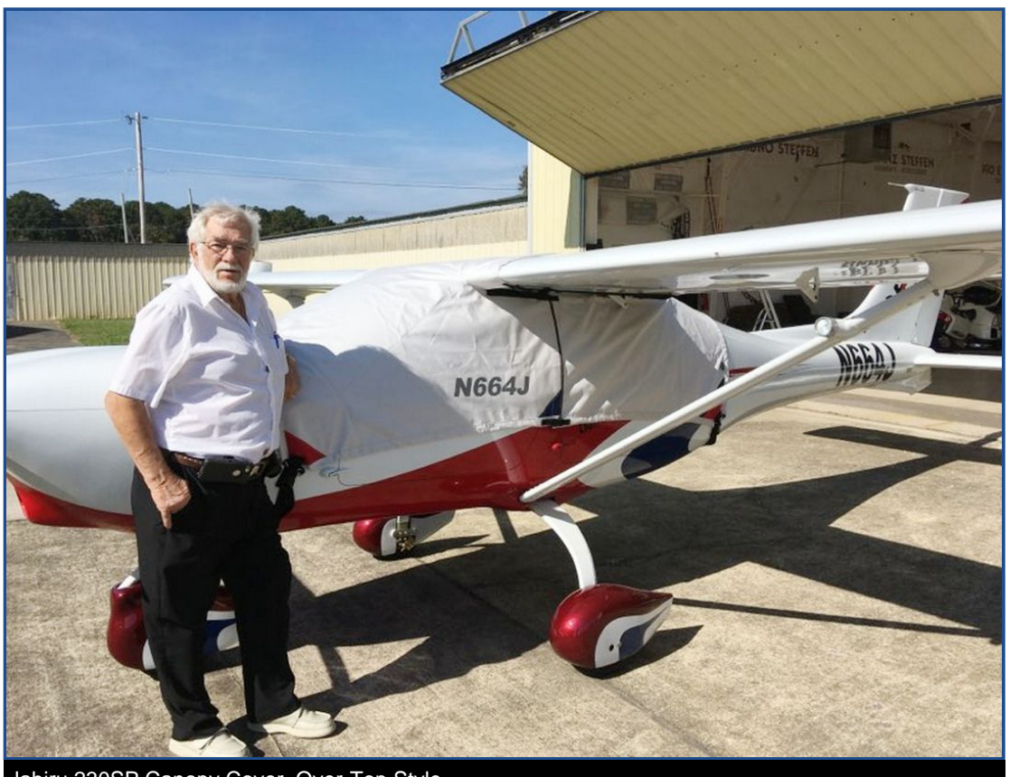
Jabiru 230SP Canopy Cover, Over-Top Style