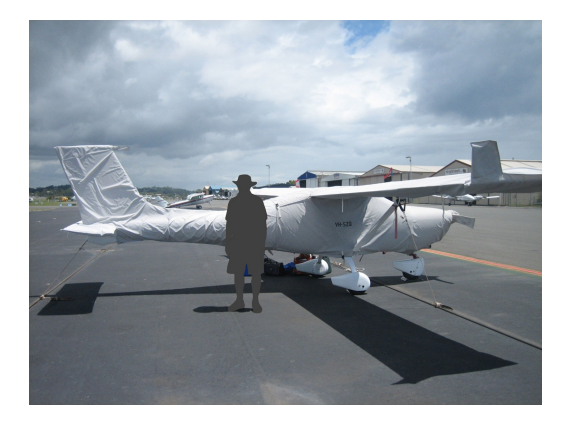
Jabiru J430 Complete Cover Set

This cover type is made from Silver Acrylic Sunbrella canvas and is 100% lined with a soft and smooth microfiber. Bruce's Custom Covers developed this material combination especially for aircraft protection. The outer material is medium weight and treated for water resistance, UV resistance and anti-static buildup. The inner lining is a very soft and smooth microfiber to prevent scratching. The material is very reflective, and tests show that the cabin interior temperature can be reduced to near-ambient temperature on the hottest of days. It is water, ice and snow repellent, yet breathable to allow moisture to escape from between the cover and the aircraft surface.