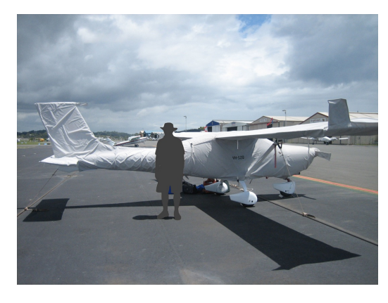
Jabiru J430 Complete Cover Set

This cover type is made from Silver Acrylic Sunbrella canvas and is 100% lined with a soft and smooth microfiber. Bruce's Custom Covers developed this material combination especially for aircraft protection. The outer material is medium weight and treated for water resistance, UV resistance and anti-static buildup. The inner lining is a very soft and smooth microfiber to prevent scratching. The material is very reflective, and tests show that the cabin interior temperature can be reduced to near-ambient temperature on the hottest of days. It is water, ice and snow repellent, yet breathable to allow moisture to escape from between the cover and the aircraft surface.