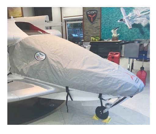
Icon A5 Canopy/Nose Cover