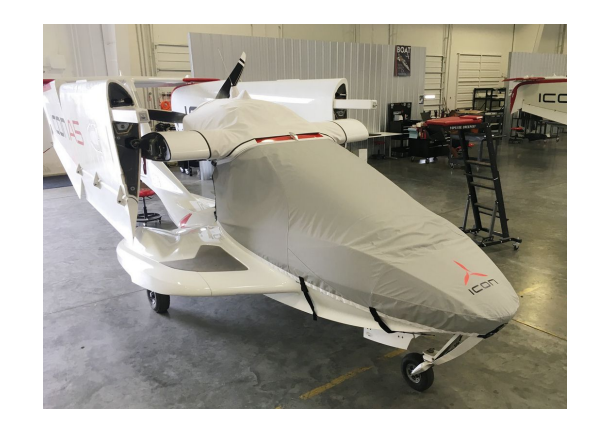
Icon A5 Travel Weight Canopy/Nose Cover, Engine Cover