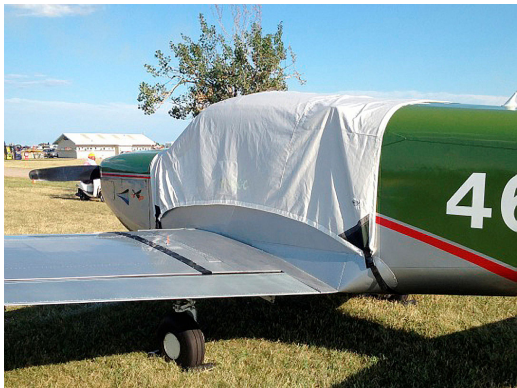
IAR Canopy Cover

the hottest of days. It is water, ice and snow repellent, yet breathable to allow moisture to escape from between the cover and the aircraft surface.