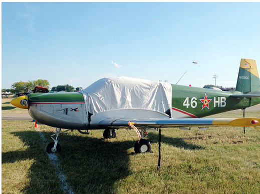
IAR Canopy Cover