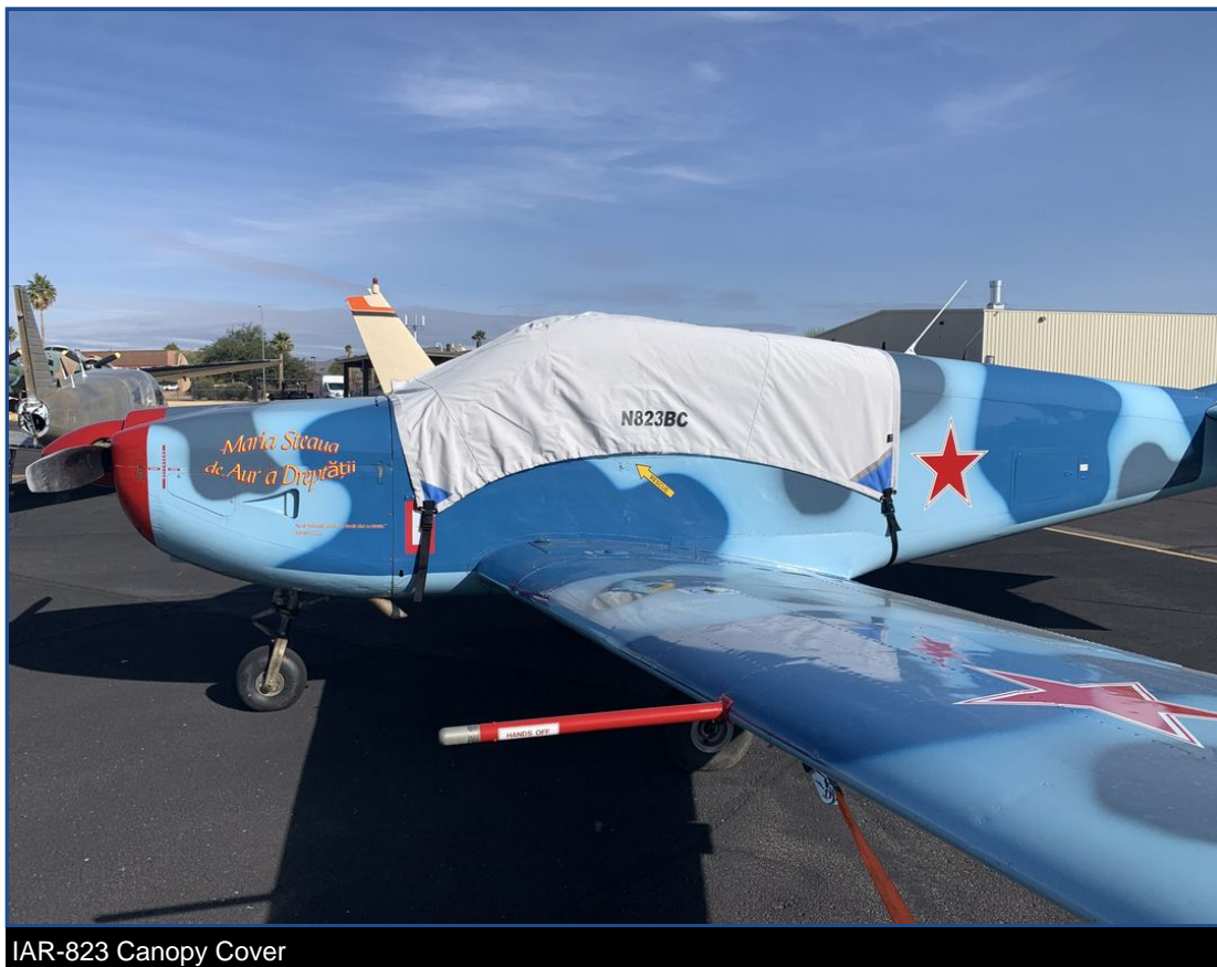
IAR-823 Canopy Cover