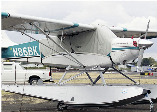
Aviat Husky Canopy Cover and Inlet Plugs

Engine Inlet Plugs are custom fit for your Aviat (Christen) Husky intakes, made with heavy-duty vinyl material, and stuffed with a single block of sculpted urethane foam. Each plug has a zipper that allows the foam to be removed and dried if necessary. Engine plugs have warning flags that are visible from the cockpit or 'remove before flight' streamers sewn onto the face of the plugs. Most plugs are imprinted with the aircraft registration number in black for an extra charge. Storage bag NOT included. Engine plugs may be inserted after flight when the engine is still warm. Engine Inlet Plugs are commonly referred to as Cowl Plugs, Intake Plugs, Cowl Blocks, Engine Blocks, and Engine Bungs.