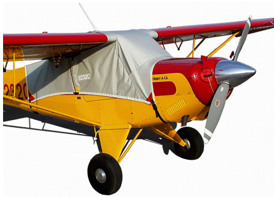
Aviat Husky Canopy Cover & Engine Plugs

Engine Inlet Plugs are custom fit for your Aviat (Christen) Husky intakes, made with heavy-duty vinyl material, and stuffed with a single block of sculpted urethane foam. Each plug has a zipper that allows the foam to be removed and dried if necessary. Engine plugs have warning flags that are visible from the cockpit or 'remove before flight' streamers sewn onto the face of the plugs. Most plugs are imprinted with the aircraft registration number in black for an extra charge. Storage bag NOT included. Engine plugs may be inserted after flight when the engine is still warm. Engine Inlet Plugs are commonly referred to as Cowl Plugs, Intake Plugs, Cowl Blocks, Engine Blocks, and Engine Bungs.