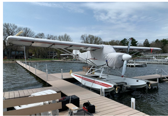
Aviat Husky Canopy, Engine, Wing, Empennage Covers