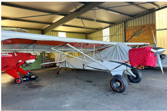
Aviat Husly Winter Cover Set

WINTER USE MATERIAL - Made with Solution-Dyed Polyester fabric, this option is intended for seasonal use to aid in deicing, rain mitigation, or for occasional travel. The material is lighter and more compact, but more susceptible to UV damage and may have a shorter useful life if used continuously outside than the all-year use material.