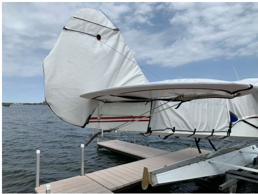
Aviat Husky Empennage Cover

This cover type is made from Silver Acrylic Sunbrella canvas and is 100% lined with a soft and smooth microfiber. Bruce's Custom Covers developed this material combination especially for aircraft protection. The outer material is medium weight and treated for water resistance, UV resistance and anti-static buildup. The inner lining is a very soft and smooth microfiber to prevent scratching. The material is very reflective, and tests show that the cabin interior temperature can be reduced to near-ambient temperature on the hottest of days. It is water, ice and snow repellent, yet breathable to allow moisture to escape from between the cover and the aircraft surface.