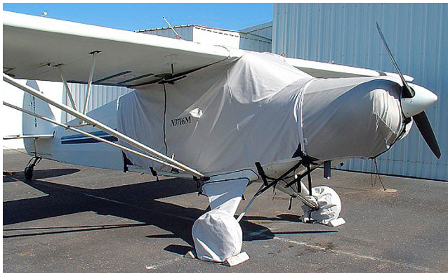
Piper PA-12 Extended Canopy, Engine & Landing Gear Covers

This cover type is made from Silver Acrylic Sunbrella canvas and is 100% lined with a soft and smooth microfiber. Bruce's Custom Covers developed this material combination especially for aircraft protection. The outer material is medium weight and treated for water resistance, UV resistance and anti-static buildup. The inner lining is a very soft and smooth microfiber to prevent scratching. The material is very reflective, and tests show that the cabin interior temperature can be reduced to near-ambient temperature on the hottest of days. It is water, ice and snow repellent, yet breathable to allow moisture to escape from between the cover and the aircraft surface.