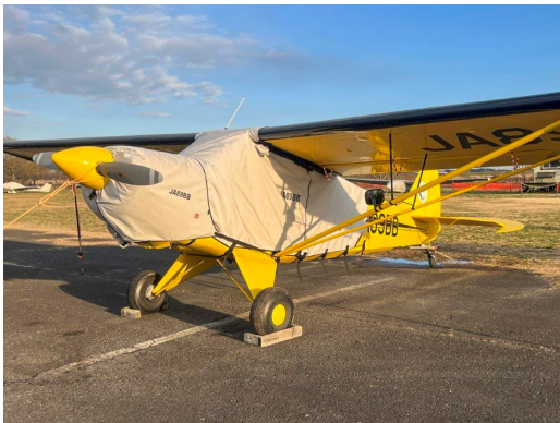
Aviat Husky Extended Canopy Cover, Engine Cover