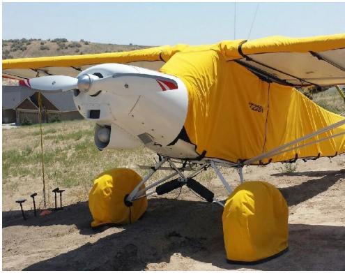
Piper PA-18 Super Cub Extended Canopy Cover, Wing & Tire Covers