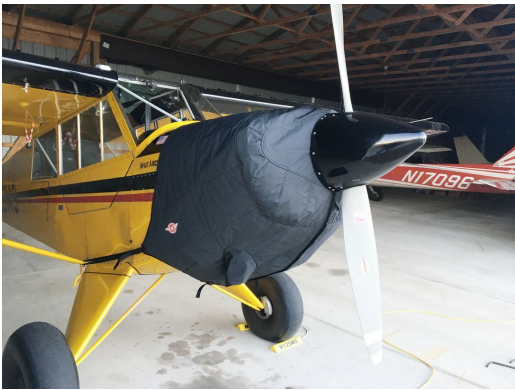
Aviat Husky Insulated Engine Cover