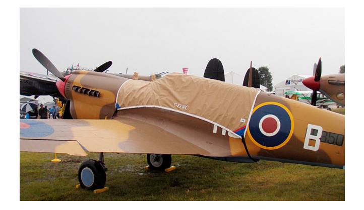
P40 Canopy Cover