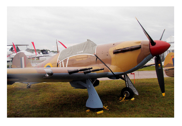
Hawker Hurricane Canopy Cover