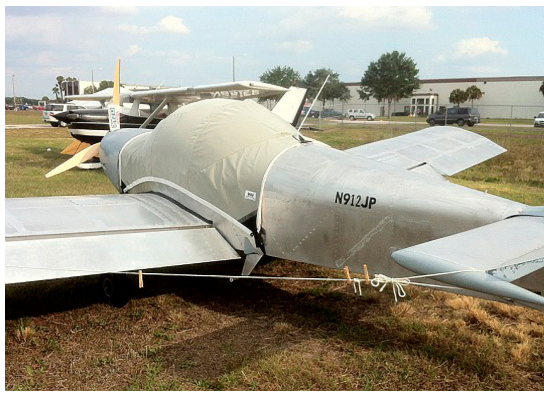
Zenith 601 XL Canopy Cover