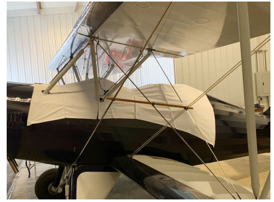
Hatz Biplane Canopy Cover, test fit cover