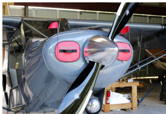
Piper PA-18 Super Cub Engine Inlet Plugs