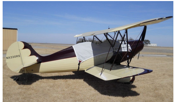
Hatz Biplane Canopy Cover