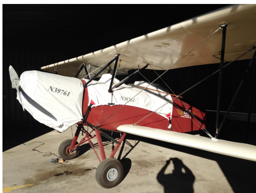
Hatz Biplane Canopy and Engine Covers