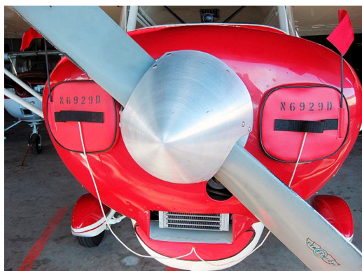
Piper PA-22-150 Engine Inlet Plugs (set of 3)

Engine Inlet Plugs are custom fit for your Hatz Biplane CB-1 intakes, made with heavy-duty vinyl material, and stuffed with a single block of sculpted urethane foam. Each plug has a zipper that allows the foam to be removed and dried if necessary. Engine plugs have warning flags that are visible from the cockpit or 'remove before flight' streamers sewn onto the face of the plugs. Most plugs are imprinted with the aircraft registration number in black for an extra charge. Storage bag NOT included. Engine plugs may be inserted after flight when the engine is still warm. Engine Inlet Plugs are commonly referred to as Cowl Plugs, Intake Plugs, Cowl Blocks, Engine Blocks, and Engine Bungs.