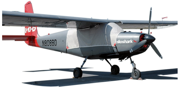
Helio Courier Canopy Cover & Engine Plugx