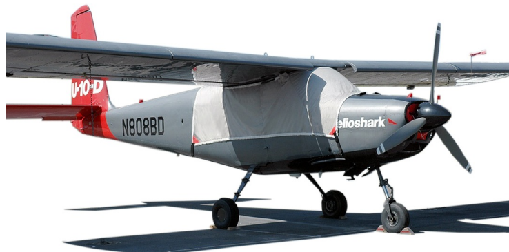
Helio Courier Canopy Cover & Engine Plugx

This cover type is made from Silver Acrylic Sunbrella canvas and is 100% lined with a soft and smooth microfiber. Bruce's Custom Covers developed this material combination especially for aircraft protection. The outer material is medium weight and treated for water resistance, UV resistance and anti-static buildup. The inner lining is a very soft and smooth microfiber to prevent scratching. The material is very reflective, and tests show that the cabin interior temperature can be reduced to near-ambient temperature on the hottest of days. It is water, ice and snow repellent, yet breathable to allow moisture to escape from between the cover and the aircraft surface.