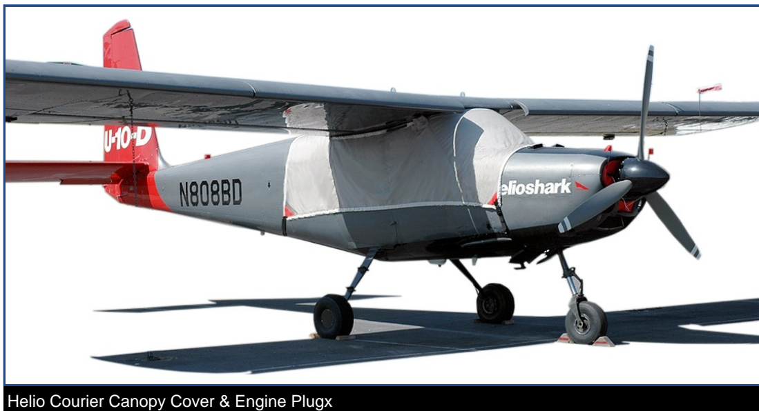
Helio Courier Canopy Cover &amp; Engine Plugx