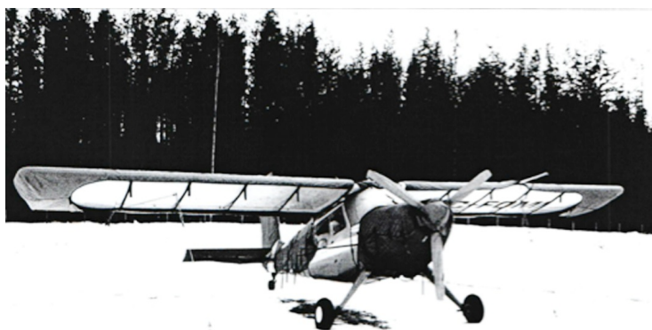
Helio Courier Wing Covers

WINTER USE MATERIAL - Made with Solution-Dyed Polyester fabric, this option is intended for seasonal use to aid in deicing, rain mitigation, or for occasional travel. The material is lighter and more compact, but more susceptible to UV damage and may have a shorter useful life if used continuously outside than the all-year use material.