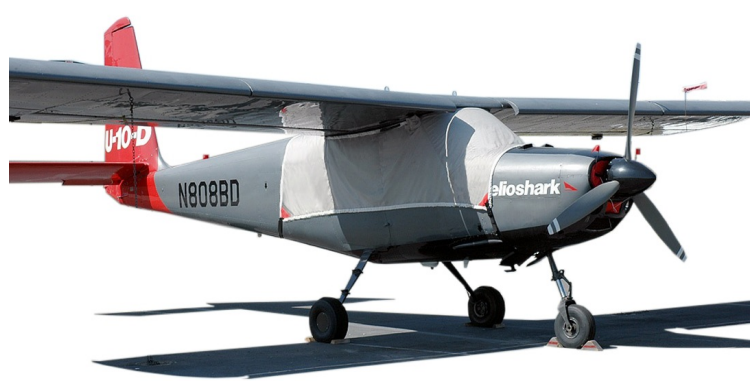
Helio Courier Canopy Cover & Engine Plugx

This cover type is made from Silver Acrylic Sunbrella canvas and is 100% lined with a soft and smooth microfiber. Bruce's Custom Covers developed this material combination especially for aircraft protection. The outer material is medium weight and treated for water resistance, UV resistance and anti-static buildup. The inner lining is a very soft and smooth microfiber to prevent scratching. The material is very reflective, and tests show that the cabin interior temperature can be reduced to near-ambient temperature on the hottest of days. It is water, ice and snow repellent, yet breathable to allow moisture to escape from between the cover and the aircraft surface.