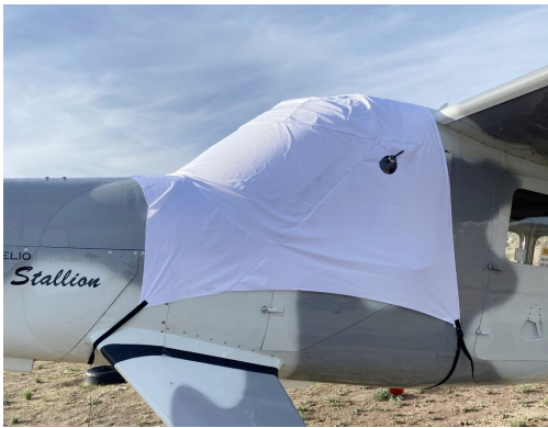
Helio Stallion Cockpit Cover, test fit cover

This cover type is made from Silver Acrylic Sunbrella canvas and is 100% lined with a soft and smooth microfiber. Bruce's Custom Covers developed this material combination especially for aircraft protection. The outer material is medium weight and treated for water resistance, UV resistance and anti-static buildup. The inner lining is a very soft and smooth microfiber to prevent scratching. The material is very reflective, and tests show that the cabin interior temperature can be reduced to near-ambient temperature on the hottest of days. It is water, ice and snow repellent, yet breathable to allow moisture to escape from between the cover and the aircraft surface.