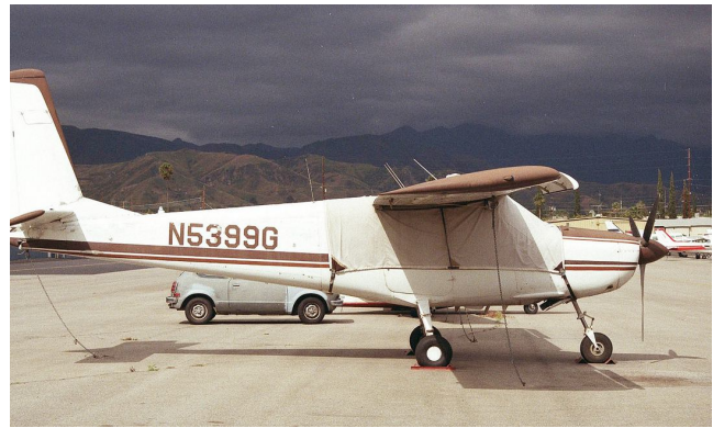
Helio Courier Canopy Cover, over top type