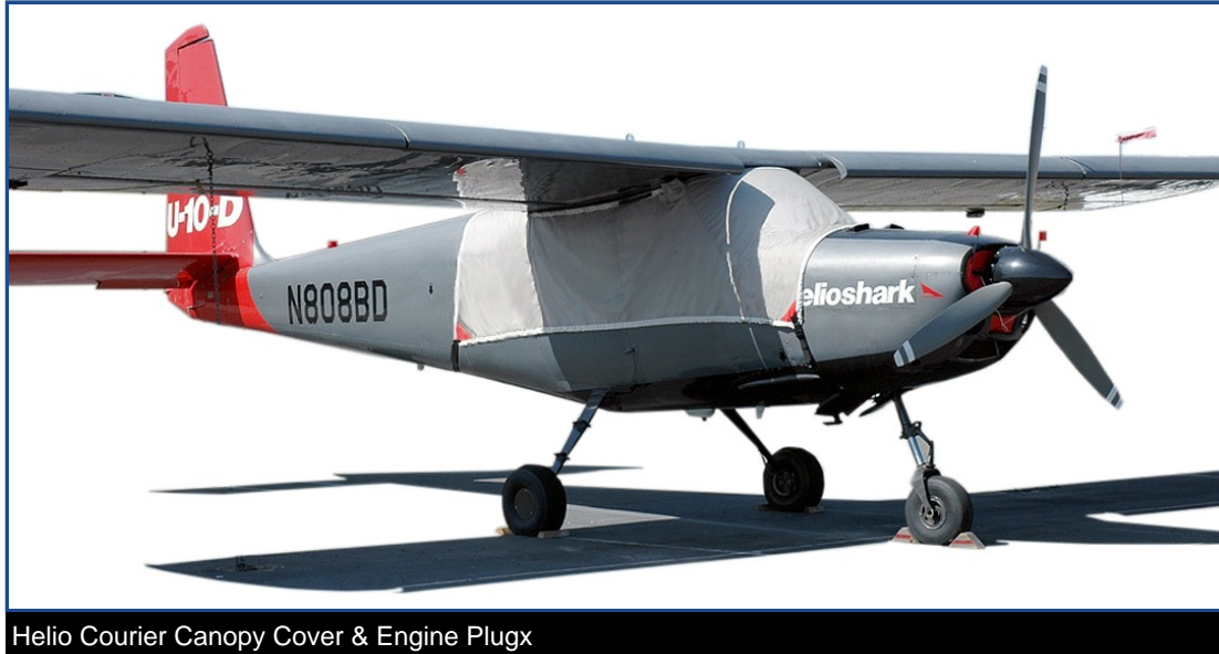
Helio Courier Canopy Cover &amp; Engine Plugx