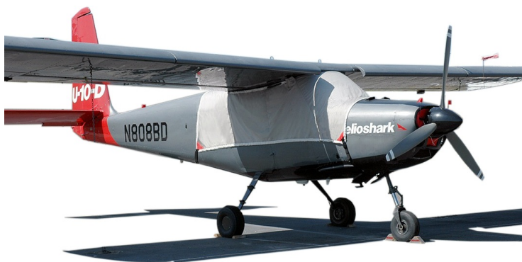
Helio Courier Canopy Cover & Engine Plugx