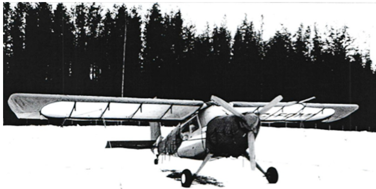
Helio Courier Wing Covers

WINTER USE MATERIAL - Made with Solution-Dyed Polyester fabric, this option is intended for seasonal use to aid in deicing, rain mitigation, or for occasional travel. The material is lighter and more compact, but more susceptible to UV damage and may have a shorter useful life if used continuously outside than the all-year use material.