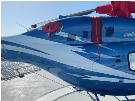
Bell 429 Exhaust Plug, Rotor Mast Cover

The Engine Exhaust Plugs are custom fit for your Eagle R&D Helicycle exhaust openings, made with heavy-duty vinyl material, and stuffed with a single block of sculpted urethane foam. Exhaust plugs have 'Remove Before Flight' streamers sewn onto the face of the plugs. Exhaust plugs may be inserted soon after flight when the engine is still warm. Engine Inlet Plugs are commonly referred to as Cowl Plugs, Intake Plugs, Cowl Blocks, Engine Blocks, and Engine Bungs.