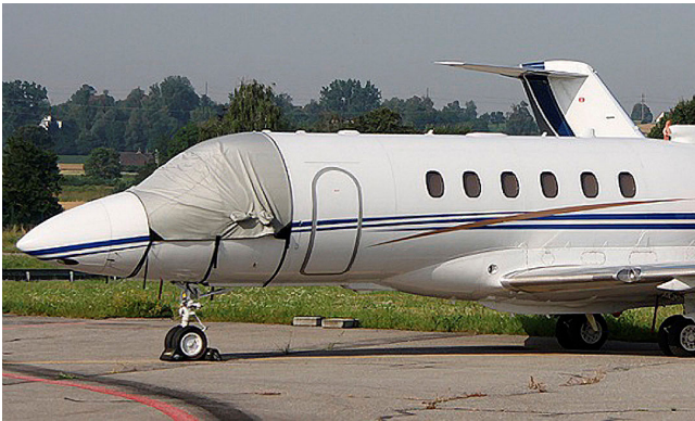
Hawker 800 Cockpit Cover

This cover type is made from Silver Acrylic Sunbrella canvas and is 100% lined with a soft and smooth microfiber. Bruce's Custom Covers developed this material combination especially for aircraft protection. The outer material is medium weight and treated for water resistance, UV resistance and anti-static buildup. The inner lining is a very soft and smooth microfiber to prevent scratching. The material is very reflective, and tests show that the cabin interior temperature can be reduced to near-ambient temperature on the hottest of days. It is water, ice and snow repellent, yet breathable to allow moisture to escape from between the cover and the aircraft surface.