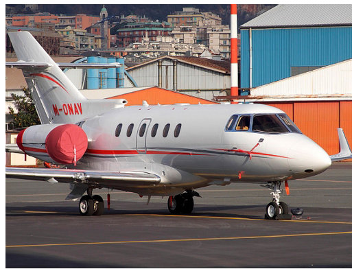
Gulfstream G550 Engine Covers, Bikini Type (3D Model) Hawker 900XP Engine Inlet/Exhaust Cover Set & Pitot AOA Cover Set