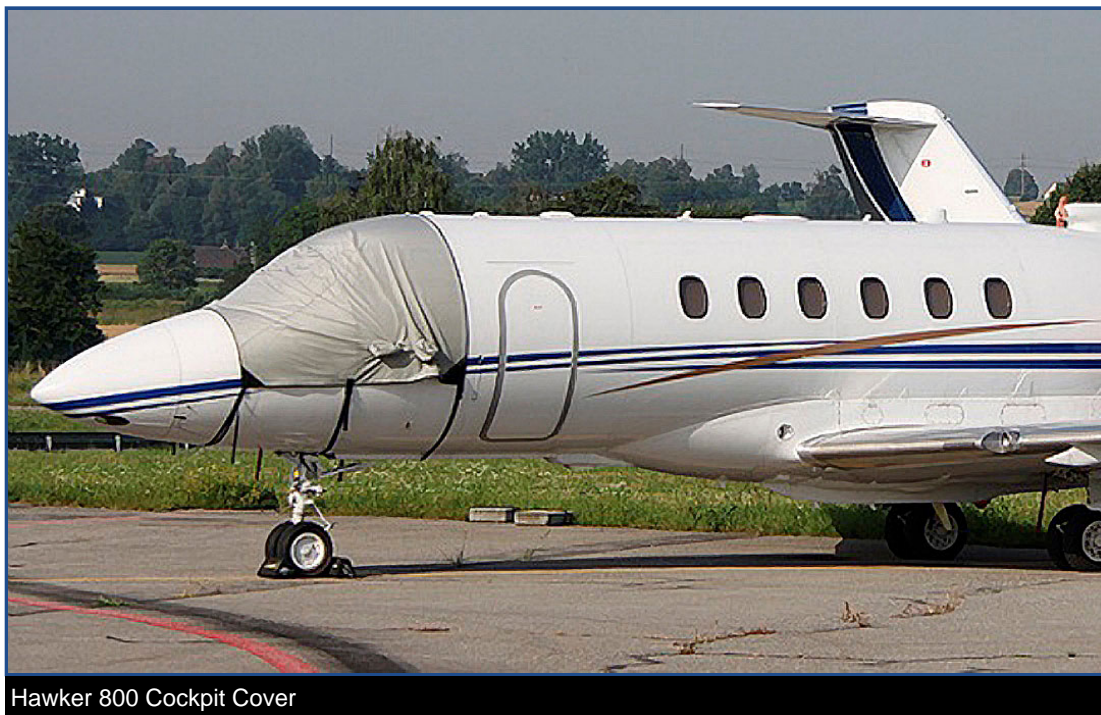
Hawker 800 Cockpit Cover