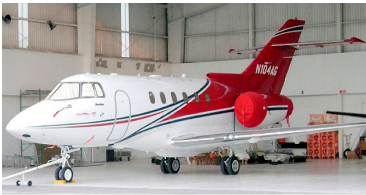
Hawker 900XP Engine Covers, Cockpit HeatShields, and Pitots/AOA Cover set