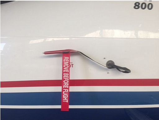
Hawker Beechcraft 800, 800XP, 850XP Pitot Covers With Aoa Straps

The Engine Inlet Plugs are custom fit for your Hawker Beechcraft 900XP intakes, made with heavy-duty vinyl material, and stuffed with a single block of sculpted urethane foam. Each plug has a zipper that allows the foam to be removed and dried if necessary. Engine plugs have 'remove before flight' streamers sewn onto the face of the plugs. Most plugs are imprinted with the aircraft registration number in black for an extra charge. Storage bag NOT included. Engine plugs may be inserted after flight when the engine is still warm. Engine Inlet Plugs are commonly referred to as Cowl Plugs, Intake Plugs, Cowl Blocks, Engine Blocks, and Engine Bungs.