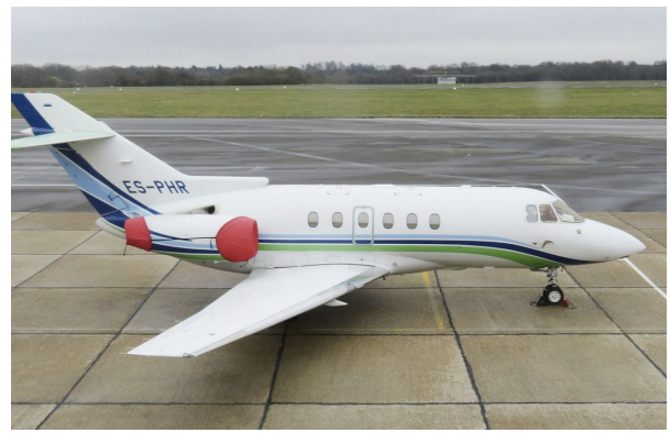
Hawker 750 Tri-Fold Engine Covers.