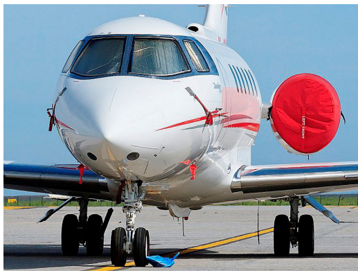
Hawker 800 Tri-Fold Engine Covers & Pitot Covers