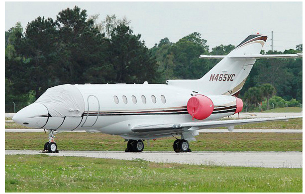
Hawker 800 Cockpit Cover and Engine Covers set