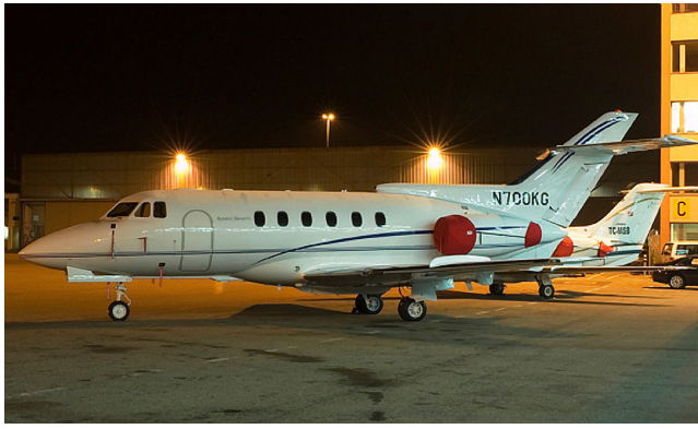
Hawker 700 Engine Cover sets w/ & w/o TR's