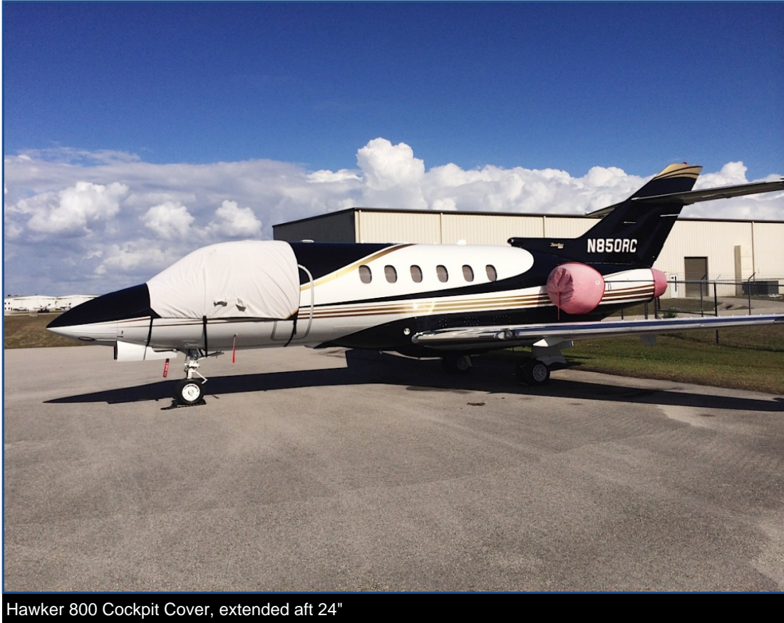
Hawker 800 Cockpit Cover, extended aft 24"