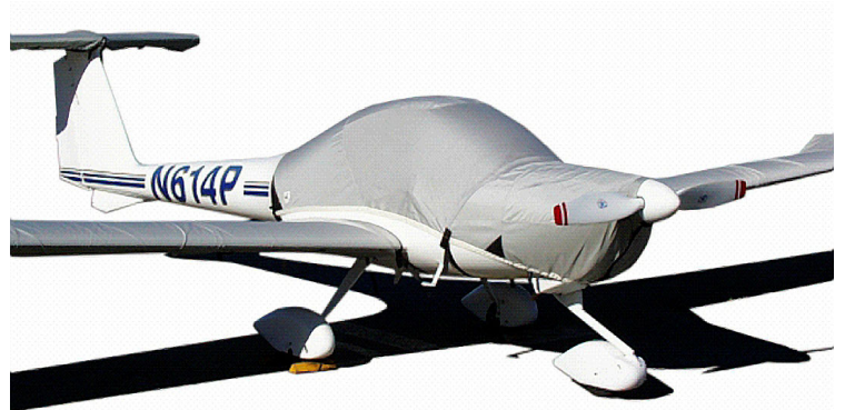
Diamond DA-20 Canopy/Engine, Wing & Horiz. Stab. Covers