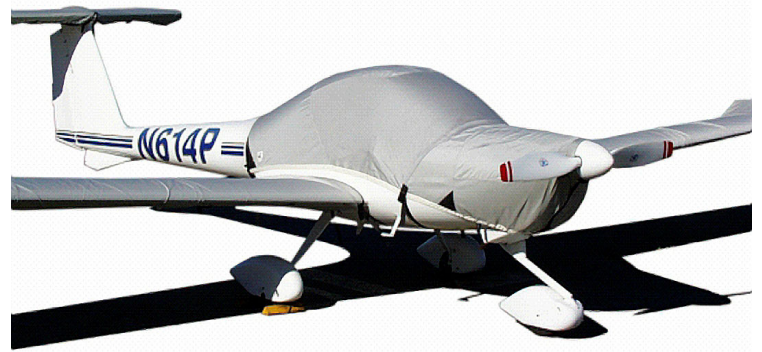
Diamond DA-20 Canopy/Engine, Wing & Horiz. Stab. Covers