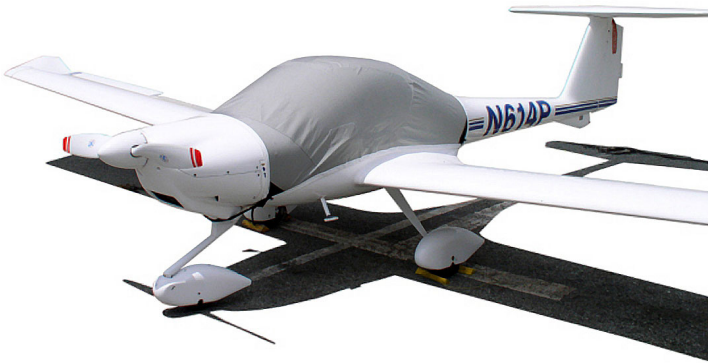
Diamond DA-20 Canopy Cover

The Dimona H36 Canopy/Engine Cover is a one-piece cover (100% lined with microfiber) that is a combination of the Canopy Cover and Engine Cover. This cover will enclose the engine cowl and will extend aft to cover all of the windows. This cover type is made from Silver Acrylic Sunbrella canvas and is 100% lined with a soft and smooth microfiber. Bruce's Custom Covers developed this material combination especially for aircraft protection. The outer material is medium weight and treated for water resistance, UV resistance and anti-static buildup. The inner lining is a very soft and smooth microfiber to prevent scratching. The material is very reflective, and tests show that the cabin interior temperature can be reduced to near-ambient temperature on the hottest of days. It is water, ice and snow repellent, yet breathable to allow moisture to escape from between the cover and the aircraft surface.