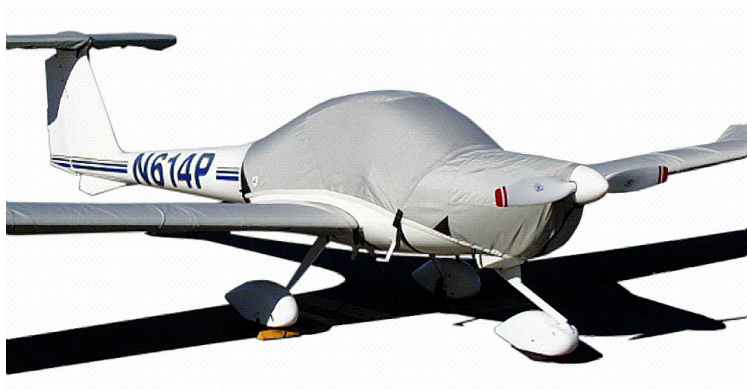
Diamond DA-20 Canopy/Engine, Wing & Horiz. Stab. Covers

The Dimona H36 Canopy/Engine Cover is a one-piece cover (100% lined with microfiber) that is a combination of the Canopy Cover and Engine Cover. This cover will enclose the engine cowl and will extend aft to cover all of the windows. This cover type is made from Silver Acrylic Sunbrella canvas and is 100% lined with a soft and smooth microfiber. Bruce's Custom Covers developed this material combination especially for aircraft protection. The outer material is medium weight and treated for water resistance, UV resistance and anti-static buildup. The inner lining is a very soft and smooth microfiber to prevent scratching. The material is very reflective, and tests show that the cabin interior temperature can be reduced to near-ambient temperature on the hottest of days. It is water, ice and snow repellent, yet breathable to allow moisture to escape from between the cover and the aircraft surface.