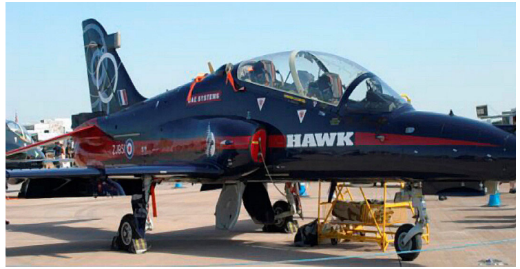
Covers, Plugs, HeatShields and related items for the British Aerospace Hawk 108