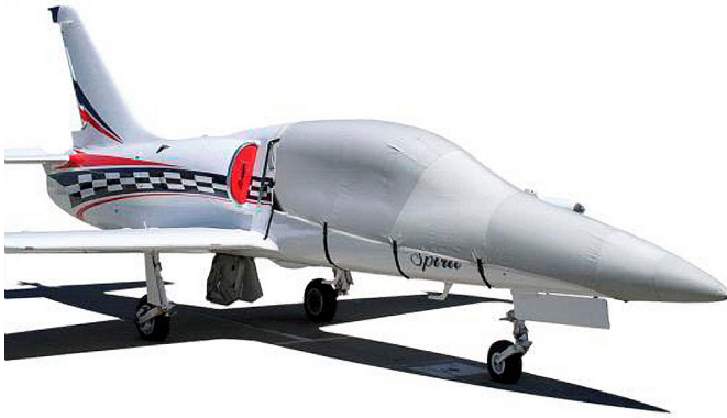
L39 Canopy/Nose Cover & Intake Plugs

This cover type is made from Silver Acrylic Sunbrella canvas and is 100% lined with a soft and smooth microfiber. Bruce's Custom Covers developed this material combination especially for aircraft protection. The outer material is medium weight and treated for water resistance, UV resistance and anti-static buildup. The inner lining is a very soft and smooth microfiber to prevent scratching. The material is very reflective, and tests show that the cabin interior temperature can be reduced to near-ambient temperature on the hottest of days. It is water, ice and snow repellent, yet breathable to allow moisture to escape from between the cover and the aircraft surface.