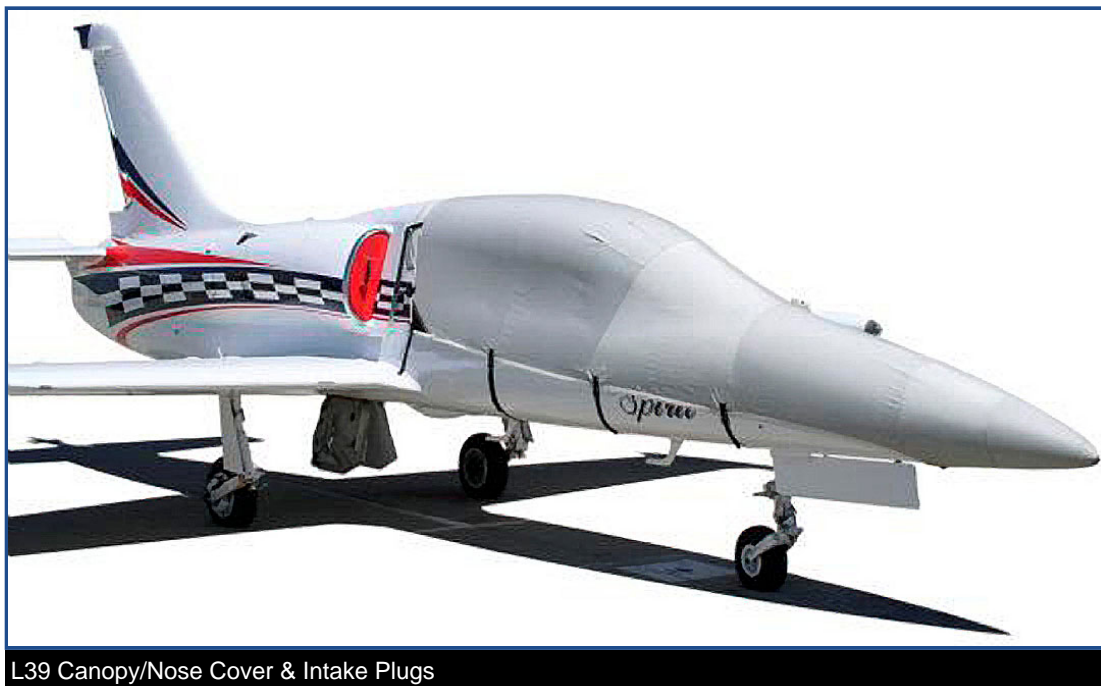
L39 Canopy/Nose Cover &amp; Intake Plugs