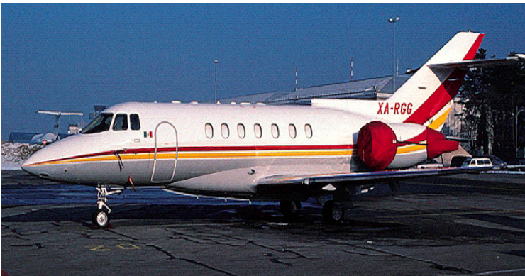
Hawker 1000 Engine Cover

The Hawker Beechcraft 1000 Intake Covers are designed to install easily yet be completely storable. A spring steel hoop is sewn into the hem of each cover, allowing them to be installed without climbing onto the wing or using a stepladder. To store the covers the spring steel hoop folds like a band-saw blade into three nesting rings. Each cover folds into a compact circular bundle which is stored in the included duffle bag, yet they unfold quickly for use. The Tri-Fold Ring cover is made of medium weight nylon which is available in a variety of colors to match the paint trim. Each cover set comes complete with installation and folding instructions. The aircraft's registration number can be silkscreened onto the cover for an extra charge.