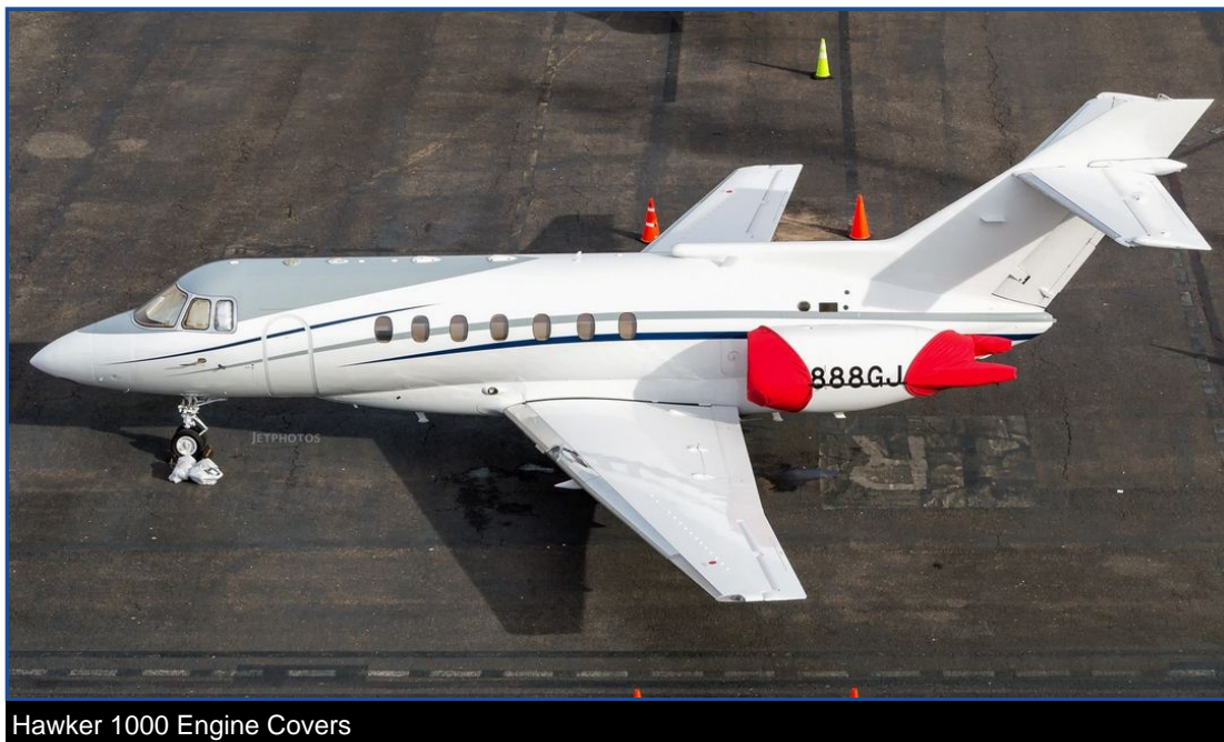
Hawker 1000 Engine Covers