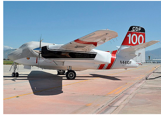
Grumman Tracker (turbine model) Canopy/Nose Cover