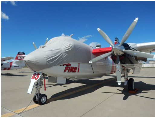
Grumman Tracker Canopy/Nose Cover