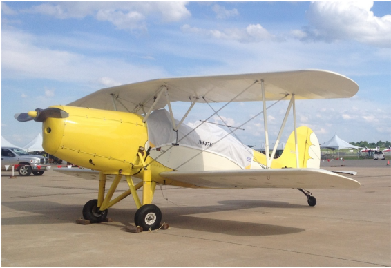
Great Lakes Canopy Cover

This cover type is made from Silver Acrylic Sunbrella canvas and is 100% lined with a soft and smooth microfiber. Bruce's Custom Covers developed this material combination especially for aircraft protection. The outer material is medium weight and treated for water resistance, UV resistance and anti-static buildup. The inner lining is a very soft and smooth microfiber to prevent scratching. The material is very reflective, and tests show that the cabin interior temperature can be reduced to near-ambient temperature on the hottest of days. It is water, ice and snow repellent, yet breathable to allow moisture to escape from between the cover and the aircraft surface.