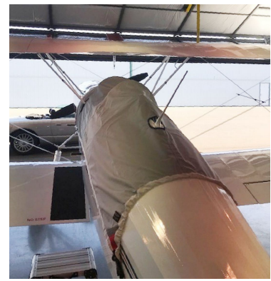
Great Lakes Sport Biplane Canopy Cover, Travel Weight