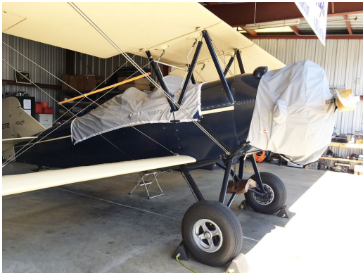
SKYBOLT, Insulated Hangar Blanket, Custom Fit Interior Use) Travel Air 4000 Canopy and Engine Covers, light weight travel type