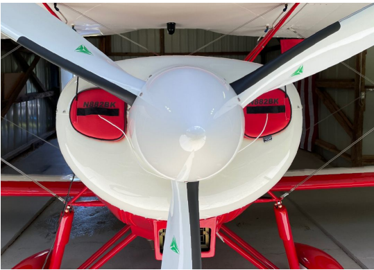
Great Lakes Engine Plugs