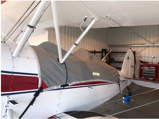
Great Lakes Sport Biplane Canopy Cover, Travel Weight