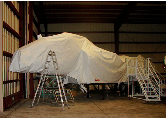
GR-7/9 FULL FUSELAGE COVER , NSN's: 1730-01-600-4557 & 1730-01-600-6757, dual seat