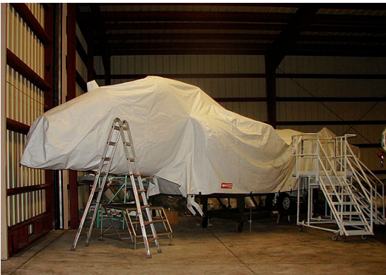
GR-7/9 FULL FUSELAGE COVER , NSN's: 1730-01-600-4557 & 1730-01-600-6757, single seat GR-7/9 FULL FUSELAGE COVER , NSN's: 1730-01-600-4557 & 1730-01-600-6757, dual seat