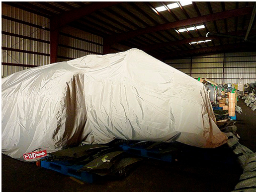
GR-7/9 FULL FUSELAGE COVER , NSN's: 1730-01-600-4557 & 1730-01-600-6757, single seat

This cover type is made from Silver Acrylic Sunbrella canvas and is 100% lined with a soft and smooth microfiber. Bruce's Custom Covers developed this material combination especially for aircraft protection. The outer material is medium weight and treated for water resistance, UV resistance and anti-static buildup. The inner lining is a very soft and smooth microfiber to prevent scratching. The material is very reflective, and tests show that the cabin interior temperature can be reduced to near-ambient temperature on the hottest of days. It is water, ice and snow repellent, yet breathable to allow moisture to escape from between the cover and the aircraft surface.