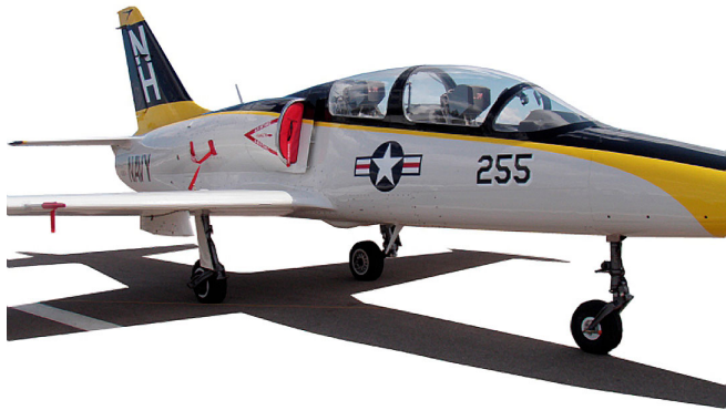
L-39 Intake Plugs

Engine Inlet Plugs are commonly referred to as Cowl Plugs, Intake Plugs, Cowl Blocks, Engine Blocks, and Engine Bungs.