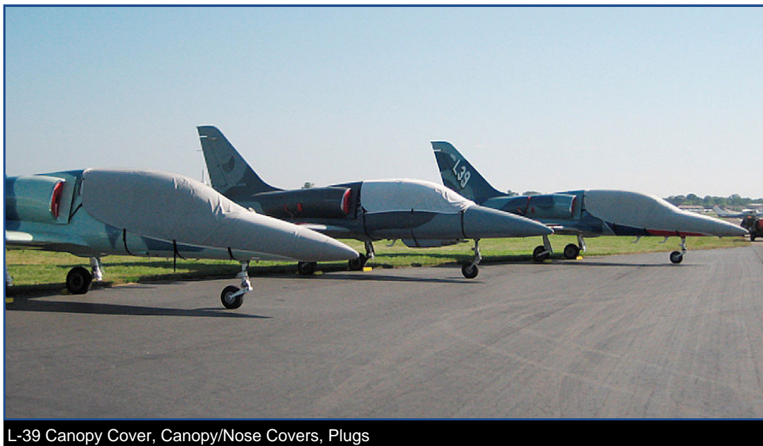
L-39 Canopy Cover, Canopy/Nose Covers, Plugs