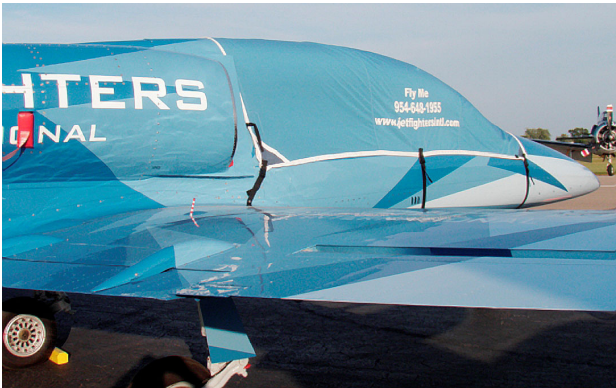
L-39 Canopy Cover & Plugs