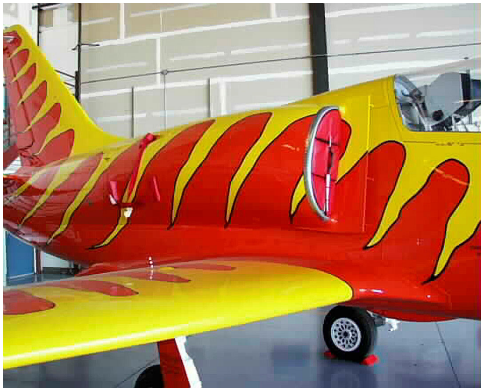
Inlet Plug, folding type