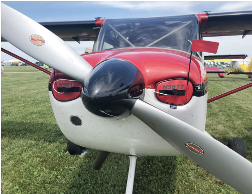
Glastar Engine Plugs

Engine Inlet Plugs are custom fit for your Glasair Aviation Glastar, Sportsman 2+2 intakes, made with heavy-duty vinyl material, and stuffed with a single block of sculpted urethane foam. Each plug has a zipper that allows the foam to be removed and dried if necessary. Engine plugs have warning flags that are visible from the cockpit or 'remove before flight' streamers sewn onto the face of the plugs. Most plugs are imprinted with the aircraft registration number in black for an extra charge. Storage bag NOT included. Engine plugs may be inserted after flight when the engine is still warm. Engine Inlet Plugs are commonly referred to as Cowl Plugs, Intake Plugs, Cowl Blocks, Engine Blocks, and Engine Bung.