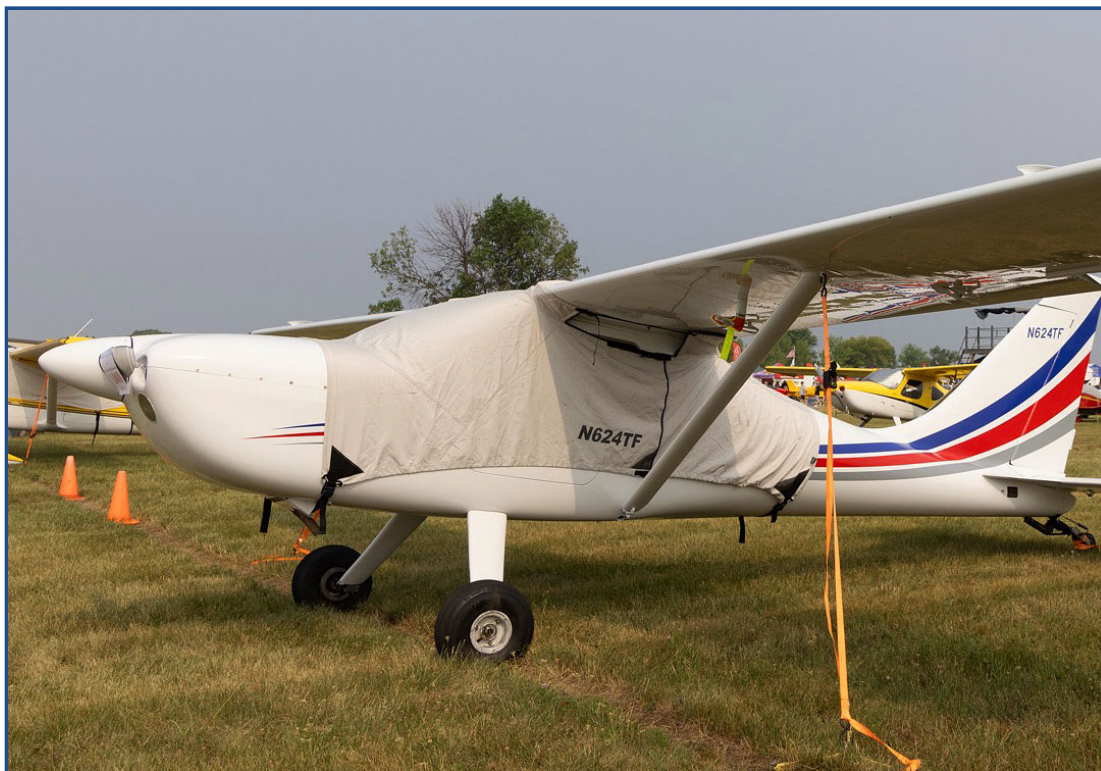
Glastar Canopy Cover