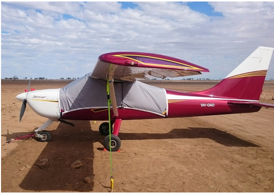
Glastar Sportsman Light Weight Travel Cover