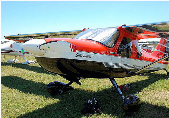
Glastar Sportsman Windshield HeatShield

Windshield Heatshields are interior sunshades for an aircraft's front windshield. The product is a unique composite of closed-cell foam with a silver mylar finish. The semi-rigid design is stiff enough to stand along the inside of the windshield using sun visors or window framing. It folds up flat and easily stores in the included storage sleeve. Some designs may require velcro and suction cups or split right and left sides. A Heatshield is an excellent short-term remedy for cockpit overheating. An external fabric cover is far more effective and practical for long-term protection.