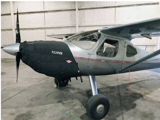
Glasair Aviation Glastar, Sportsman 2+2 Insulated Engine Cover

This cover type is made from Silver Acrylic Sunbrella canvas and is 100% lined with a soft and smooth microfiber. Bruce's Custom Covers developed this material combination especially for aircraft protection. The outer material is medium weight and treated for water resistance, UV resistance and anti-static buildup. The inner lining is a very soft and smooth microfiber to prevent scratching. The material is very reflective, and tests show that the cabin interior temperature can be reduced to near-ambient temperature on the hottest of days. It is water, ice and snow repellent, yet breathable to allow moisture to escape from between the cover and the aircraft surface.