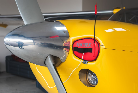
Glastar Engine Inlet Plugs