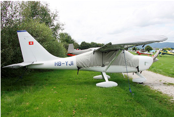
Glastar Canopy, Wings, Horizontal Stab. & Prop Covers

WINTER USE MATERIAL - Made with Solution-Dyed Polyester fabric, this option is intended for seasonal use to aid in deicing, rain mitigation, or for occasional travel. The material is lighter and more compact, but more susceptible to UV damage and may have a shorter useful life if used continuously outside than the all-year use material.