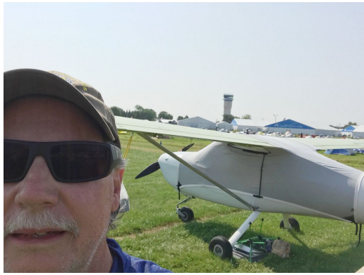
Glastar Sportsman Travel Weight Canopy Cover