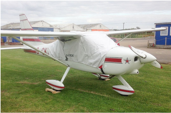
Glastar Over-Top Canopy Cover

This cover type is made from Silver Acrylic Sunbrella canvas and is 100% lined with a soft and smooth microfiber. Bruce's Custom Covers developed this material combination especially for aircraft protection. The outer material is medium weight and treated for water resistance, UV resistance and anti-static buildup. The inner lining is a very soft and smooth microfiber to prevent scratching. The material is very reflective, and tests show that the cabin interior temperature can be reduced to near-ambient temperature on the hottest of days. It is water, ice and snow repellent, yet breathable to allow moisture to escape from between the cover and the aircraft surface.