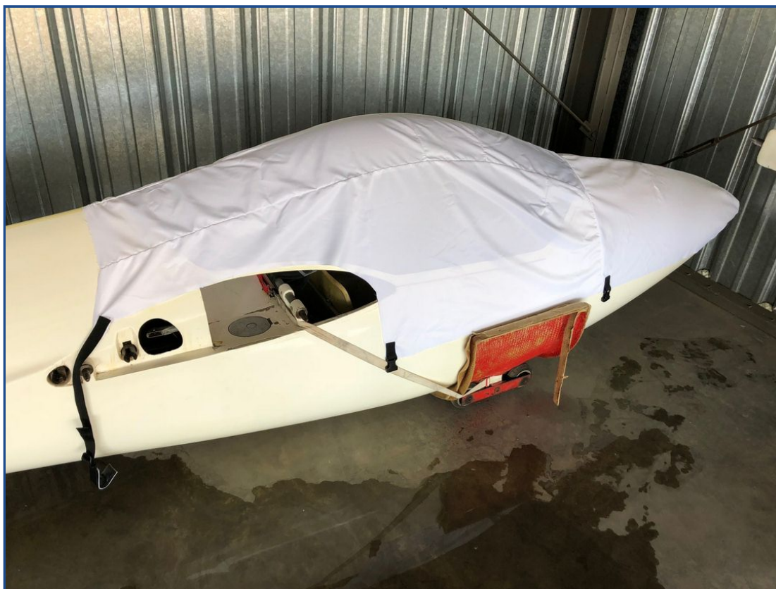
Glasflugel H-301B Libelle Canopy/Nose Cover, test fit cover