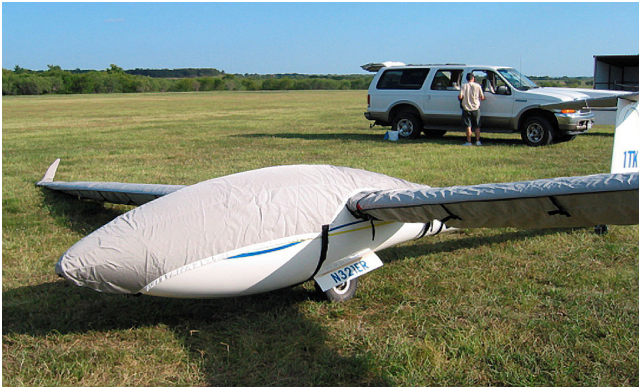
Canopy/Nose Cover, Wings and Horizontal Stab Covers

water resistance, UV resistance and anti-static buildup. The inner lining is a very soft and smooth microfiber to prevent scratching. The material is very reflective, and tests show that the cabin interior temperature can be reduced to near-ambient temperature on the hottest of days. It is water, ice and snow repellent, yet breathable to allow moisture to escape from between the cover and the aircraft surface.