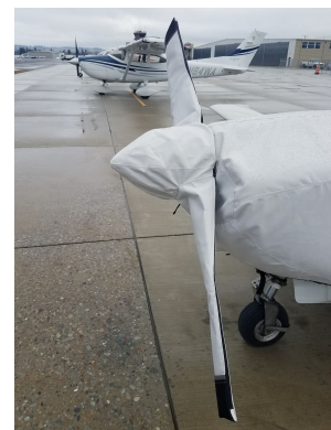
Glasair Aviation Glasair II & III Propellor/Spinner Cover, 2 Blade Glasair Aviation Glasair II & III Propellor/Spinner Cover, 2 Blade