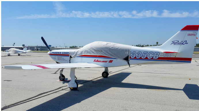
Glasair III Canopy Cover

This cover type is made from Silver Acrylic Sunbrella canvas and is 100% lined with a soft and smooth microfiber. Bruce's Custom Covers developed this material combination especially for aircraft protection. The outer material is medium weight and treated for water resistance, UV resistance and anti-static buildup. The inner lining is a very soft and smooth microfiber to prevent scratching. The material is very reflective, and tests show that the cabin interior temperature can be reduced to near-ambient temperature on the hottest of days. It is water, ice and snow repellent, yet breathable to allow moisture to escape from between the cover and the aircraft surface.