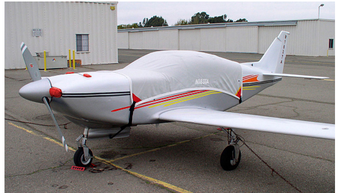
Glasair II/III Canopy Cover & Plugs