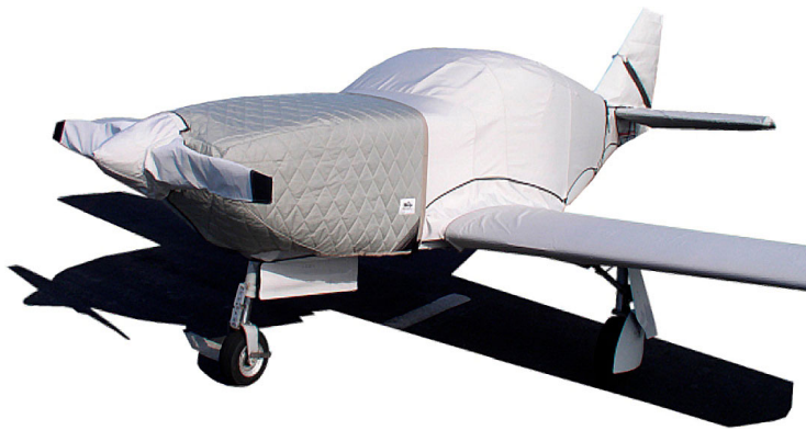
Glasair I Insulated Engine Cover, Prop Cover, Etc.