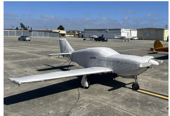
Glasair II Complete Cover Set