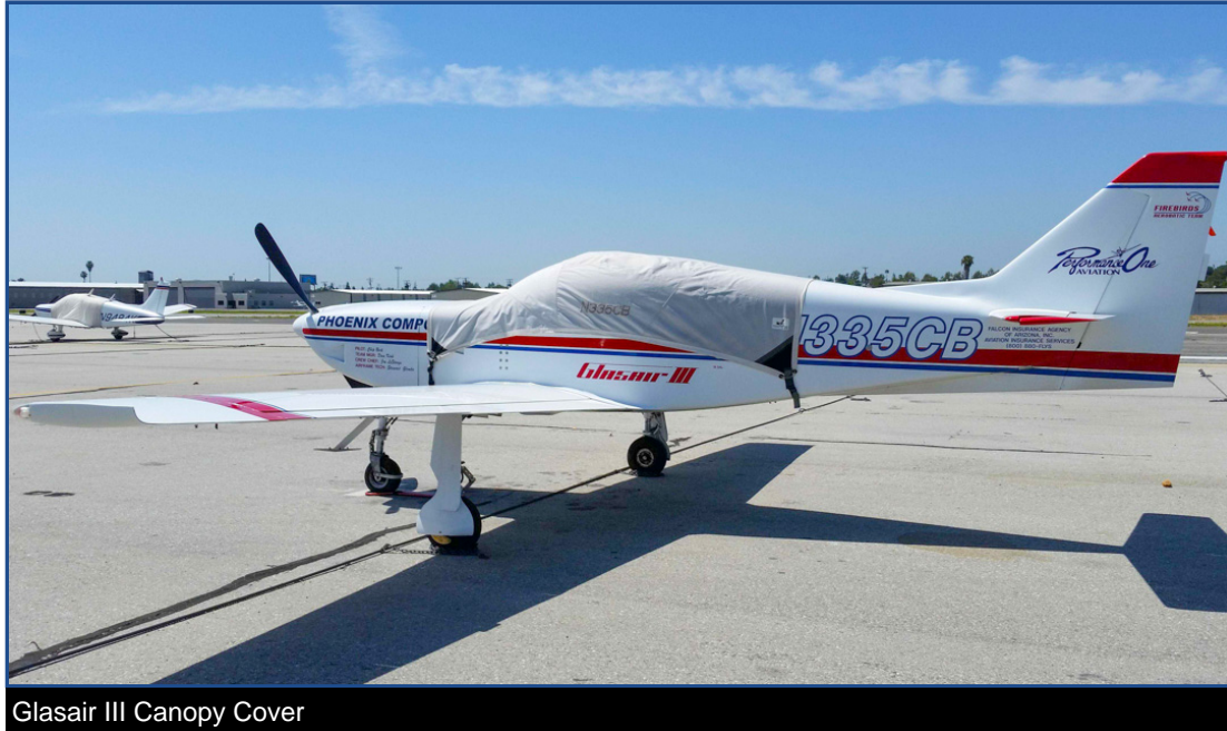
Glasair III Canopy Cover