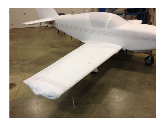
Glasair Aviation Glasair I Complete Fuselage Cover W/Detachable Wing Covers

This cover type is made from Silver Acrylic Sunbrella canvas and is 100% lined with a soft and smooth microfiber. Bruce's Custom Covers developed this material combination especially for aircraft protection. The outer material is medium weight and treated for water resistance, UV resistance and anti-static buildup. The inner lining is a very soft and smooth microfiber to prevent scratching. The material is very reflective, and tests show that the cabin interior temperature can be reduced to near-ambient temperature on the hottest of days. It is water, ice and snow repellent, yet breathable to allow moisture to escape from between the cover and the aircraft surface.