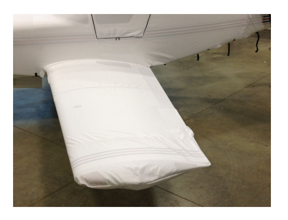
Glasair Aviation Glasair I Complete Fuselage Cover W/Detachable Wing Covers