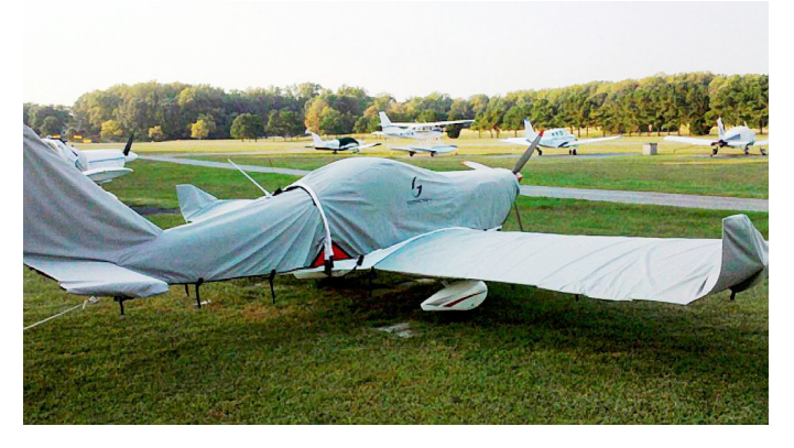
Gobosh Full Cover Set