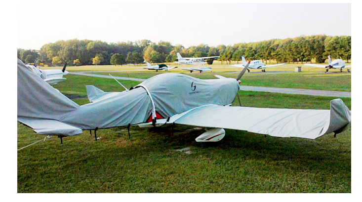
Gobosh Full Cover Set