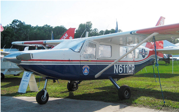
Gippsland GA-8 Airvan Cockpit & Cabin HeatShield Set

Cockpit Heatshields are interior sunshades for the aircraft's cockpit. The product is a unique composite of closed-cell foam with a silver mylar finish. The semi-rigid design is stiff enough to stand inside the window framing. The set folds up flat and is easily stored in the included storage sleeve. Some designs may require velcro and suction cups. A Heatshield is an excellent short-term remedy for cockpit overheating, but an external fabric cover is more effective for long-term protection.