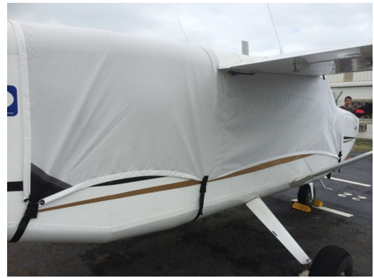
Gippsland GA-8 Airvan Canopy Cover