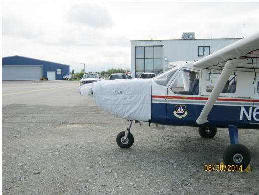
Gippsland GA-8 Airvan Insulated Engine and Prop Covers

This cover type is made from Silver Acrylic Sunbrella canvas and is 100% lined with a soft and smooth microfiber. Bruce's Custom Covers developed this material combination especially for aircraft protection. The outer material is medium weight and treated for water resistance, UV resistance and anti-static buildup. The inner lining is a very soft and smooth microfiber to prevent scratching. The material is very reflective, and tests show that the cabin interior temperature can be reduced to near-ambient temperature on the hottest of days. It is water, ice and snow repellent, yet breathable to allow moisture to escape from between the cover and the aircraft surface.