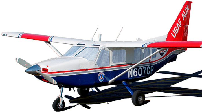
Covers, Plugs & HeatShields for the Gippsland GA-8 Airvan