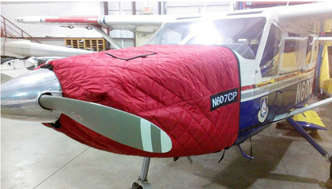
GA-8 Insulated Engine Cover