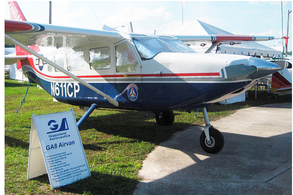
Gippsland GA-8 Airvan Cockpit & Cabin HeatShield Set