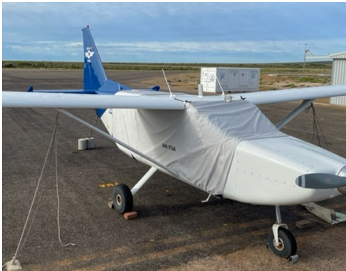
Gippsland GA-8 Extended Canopy Cover

This cover type is made from Silver Acrylic Sunbrella canvas and is 100% lined with a soft and smooth microfiber. Bruce's Custom Covers developed this material combination especially for aircraft protection. The outer material is medium weight and treated for water resistance, UV resistance and anti-static buildup. The inner lining is a very soft and smooth microfiber to prevent scratching. The material is very reflective, and tests show that the cabin interior temperature can be reduced to near-ambient temperature on the hottest of days. It is water, ice and snow repellent, yet breathable to allow moisture to escape from between the cover and the aircraft surface.