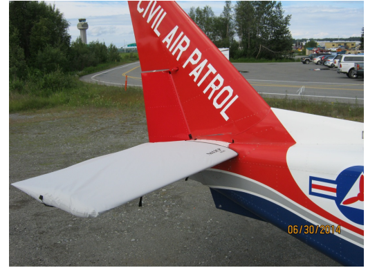
Gippsland GA-8 Airvan Horizontal Stab. Cover