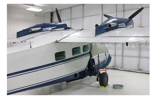
Grumman G44 Widgeon Cockpit/Nose Cover

Canopy Covers are commonly referred to as Cabin Covers, Fuselage Covers, Canvas Covers, Canopy Caps, etc.