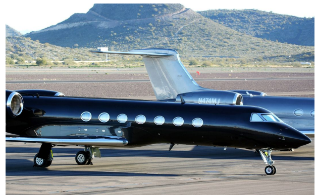
Gulfstream Cockpit Heatshields