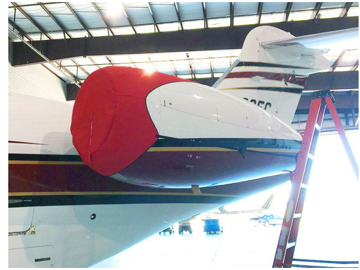
Canadair Challenger 300 Intake/Exhaust Covers, 3-Strap Type Canadair Challenger 300 Intake/Exhaust Covers, 3-Strap Type