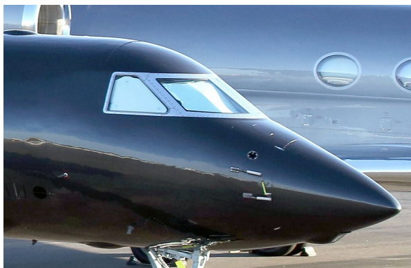
Gulfstream Cockpit Heatshields

Cockpit Heatshields are interior sunshades for the aircraft's cockpit. The product is a unique composite of closed-cell foam with a silver mylar finish. The semi-rigid design is stiff enough to stand inside the window framing. The set folds up flat and is easily stored in the included storage sleeve. Some designs may require velcro and suction cups. Our Heatshields for jets are offered white side out because some aircraft manufacturers have issued advisories against reflective window inserts due to potential heat damage. A Heatshield is an excellent short-term remedy for cockpit overheating, but an external fabric cover is more effective for long-term protection.