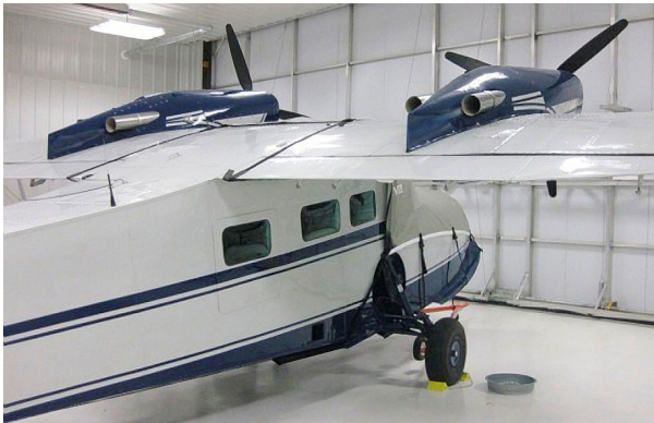
Grumman G44 Widgeon Cockpit/Nose Cover

This cover type is made from Silver Acrylic Sunbrella canvas and is 100% lined with a soft and smooth microfiber. Bruce's Custom Covers developed this material combination especially for aircraft protection. The outer material is medium weight and treated for water resistance, UV resistance and anti-static buildup. The inner lining is a very soft and smooth microfiber to prevent scratching. The material is very reflective, and tests show that the cabin interior temperature can be reduced to near-ambient temperature on the hottest of days. It is water, ice and snow repellent, yet breathable to allow moisture to escape from between the cover and the aircraft surface.