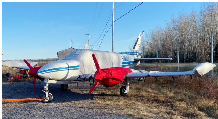
Cessna 340A Extended Canopy, Wing, Insulated Engine & Prop Covers

The material is very reflective, and tests show that the cabin interior temperature can be reduced to near-ambient temperature on the hottest of days. It is water, ice and snow repellent, yet breathable to allow moisture to escape from between the cover and the aircraft surface.