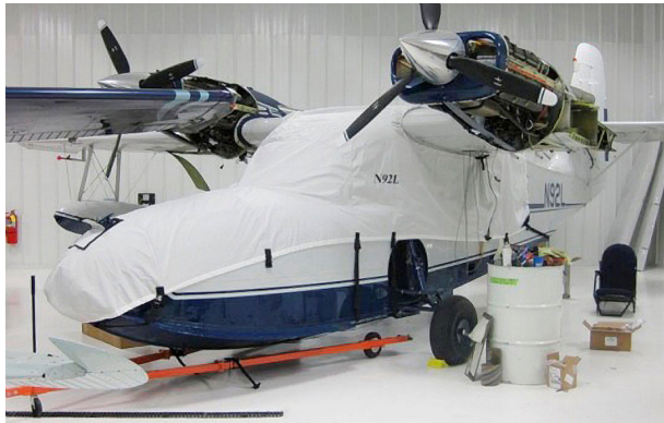
Grumman G44 Widgeon Canopy/Nose Cover