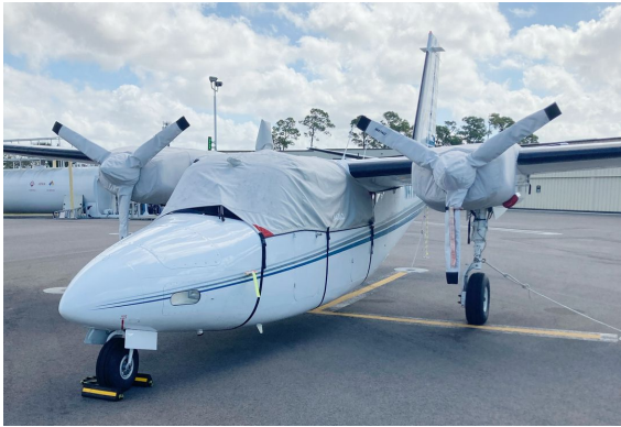
Aero Commander 500S Shrike Canopy, Engine & Prop Covers

The material is very reflective, and tests show that the cabin interior temperature can be reduced to near-ambient temperature on the hottest of days. It is water, ice and snow repellent, yet breathable to allow moisture to escape from between the cover and the aircraft surface.