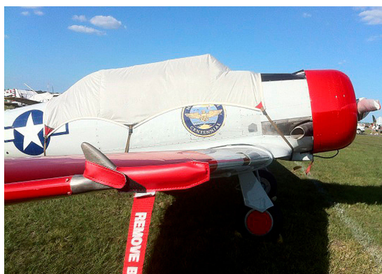
T6 Pitot, Canopy & Prop Covers

Grumman Widgeon G-44 Pitot Tube Covers , NOT HEAT RESISTANT TYPE, are made of Naugahyde vinyl, and are designed to cover the entire pitot assembly. Slipping over the tube, the cover tightens around the base with a Velcro strap detail. A "Remove Before Flight" streamer is attached to the cover. Heat Resistant Pitot Covers are an upgrade to this design, and help prevent the pitot cover from melting onto the tube if the pitot heat is accidentally turned on while installed. If you want the set tethered together, please let us know.