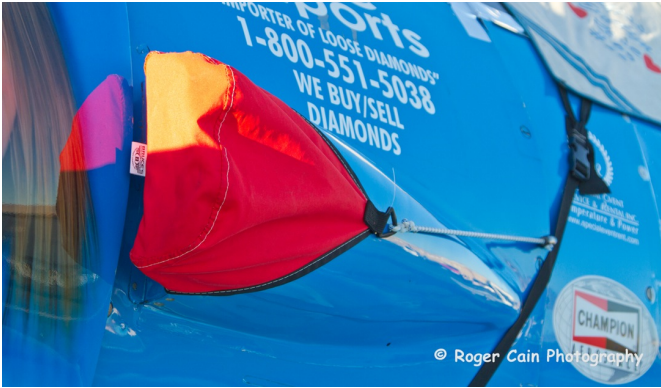
North American T6 Carb Air Scoop Cover