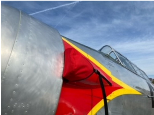
North American T6 Carb Air Scoop Cover

The material is very reflective, and tests show that the cabin interior temperature can be reduced to near-ambient temperature on the hottest of days. It is water, ice and snow repellent, yet breathable to allow moisture to escape from between the cover and the aircraft surface.