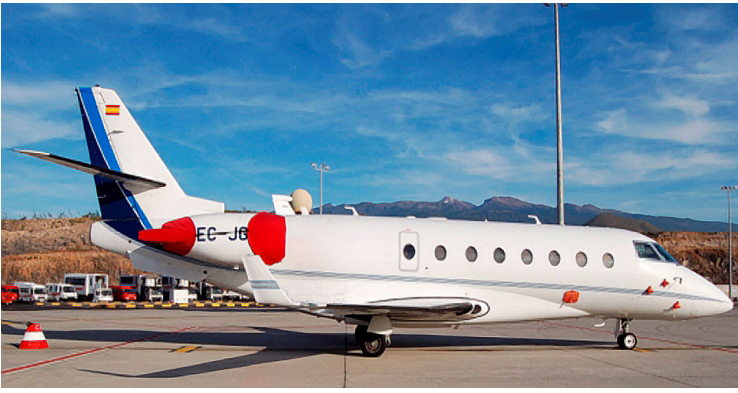
Gulfstream 200 Engine Cover set