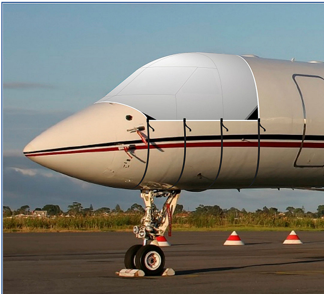
G-V Cockpit/Windshield Cover (Illustration)