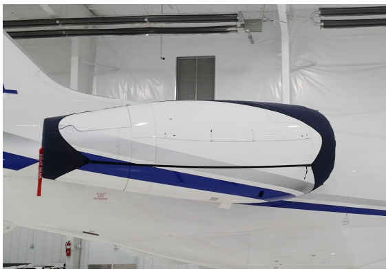
Challenger 300 Intake/Exhaust Cover Set, 3-strap type