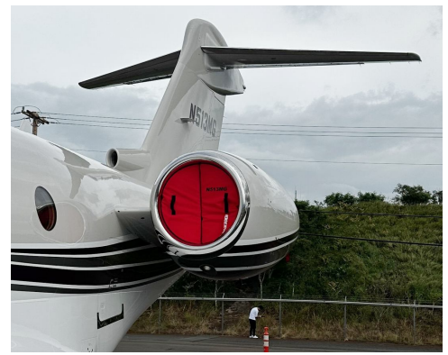
Gulfstream G280 Intake Plugs