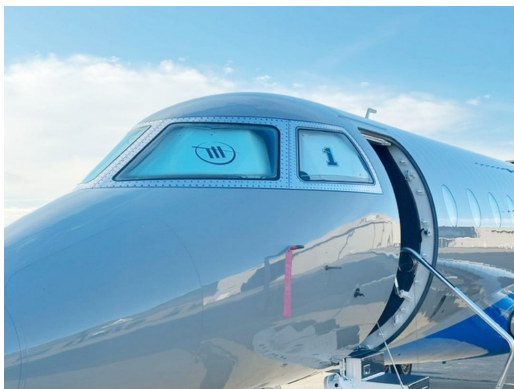
Gulfstream G200 Cockpit Heatshields

Cockpit Heatshields are interior sunshades for the aircraft's cockpit. The product is a unique composite of closed-cell foam with a silver mylar finish. The semi-rigid design is stiff enough to stand inside the window framing. The set folds up flat and is easily stored in the included storage sleeve. Some designs may require velcro and suction cups. Our Heatshields for jets are offered white side out because some aircraft manufacturers have issued advisories against reflective window inserts due to potential heat damage. A Heatshield is an excellent short-term remedy for cockpit overheating, but an external fabric cover is more effective for long-term protection.