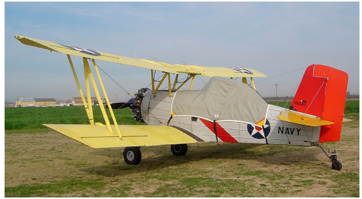
Canopy Cover for the Grumman Ag Cat