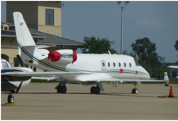
Gulfstream G150 Engine Cover Set