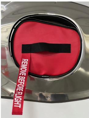
Gulfstream V APU Exhaust Plug

The Engine Inlet Plugs are custom fit for your Gulfstream Aerospace Gulfstream G150 intakes, made with heavy-duty vinyl material, and stuffed with a single block of sculpted urethane foam. Each plug has a zipper that allows the foam to be removed and dried if necessary. Engine plugs have 'remove before flight' streamers sewn onto the face of the plugs. Most plugs are imprinted with the aircraft registration number in black for an extra charge. Storage bag NOT included. Engine plugs may be inserted after flight when the engine is still warm. Engine Inlet Plugs are commonly referred to as Cowl Plugs, Intake Plugs, Cowl Blocks, Engine Blocks, and Engine Bungs.