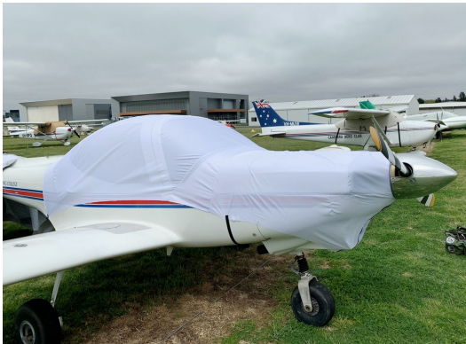
Grob 115 Canopy/Engine Cover, test fit cover

The Grob 115 Canopy/Engine Cover is a one-piece cover (100% lined with microfiber) that is a combination of the Canopy Cover and Engine Cover. This cover will enclose the engine cowl and will extend aft to cover all of the windows. This cover type is made from Silver Acrylic Sunbrella canvas and is 100% lined with a soft and smooth microfiber. Bruce's Custom Covers developed this material combination especially for aircraft protection. The outer material is medium weight and treated for water resistance, UV resistance and anti-static buildup. The inner lining is a very soft and smooth microfiber to prevent scratching. The material is very reflective, and tests show that the cabin interior temperature can be reduced to near-ambient temperature on the hottest of days. It is water, ice and snow repellent, yet breathable to allow moisture to escape from between the cover and the aircraft surface.