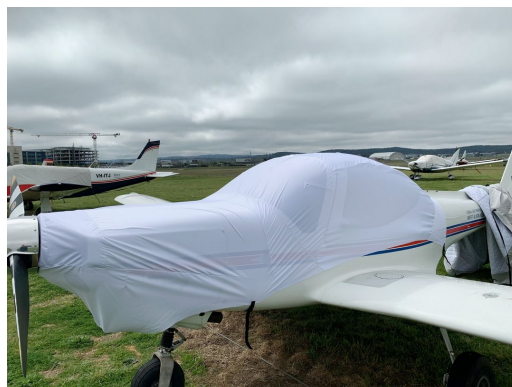
Grob 115 Canopy/Engine Cover, test fit cover