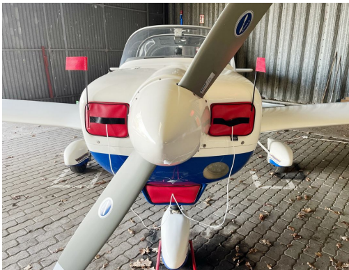
Grob 115 Engine Inlet Plugs, Incl. Carb. Inlet Plug

Engine Inlet Plugs are custom fit for your Grob 115 intakes, made with heavy-duty vinyl material, and stuffed with a single block of sculpted urethane foam. Each plug has a zipper that allows the foam to be removed and dried if necessary. Engine plugs have warning flags that are visible from the cockpit or 'remove before flight' streamers sewn onto the face of the plugs. Most plugs are imprinted with the aircraft registration number in black for an extra charge. Storage bag NOT included. Engine plugs may be inserted after flight when the engine is still warm. Engine Inlet Plugs are commonly referred to as Cowl Plugs, Intake Plugs, Cowl Blocks, Engine Blocks, and Engine Bungs.