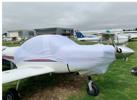
Grob 115 Canopy/Engine Cover, test fit cover

The Grob 115 Canopy/Engine Cover is a one-piece cover (100% lined with microfiber) that is a combination of the Canopy Cover and Engine Cover. This cover will enclose the engine cowl and will extend aft to cover all of the windows. This cover type is made from Silver Acrylic Sunbrella canvas and is 100% lined with a soft and smooth microfiber. Bruce's Custom Covers developed this material combination especially for aircraft protection. The outer material is medium weight and treated for water resistance, UV resistance and anti-static buildup. The inner lining is a very soft and smooth microfiber to prevent scratching. The material is very reflective, and tests show that the cabin interior temperature can be reduced to near-ambient temperature on the hottest of days. It is water, ice and snow repellent, yet breathable to allow moisture to escape from between the cover and the aircraft surface.