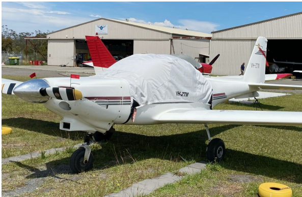
Grob 115 Canopy Cover