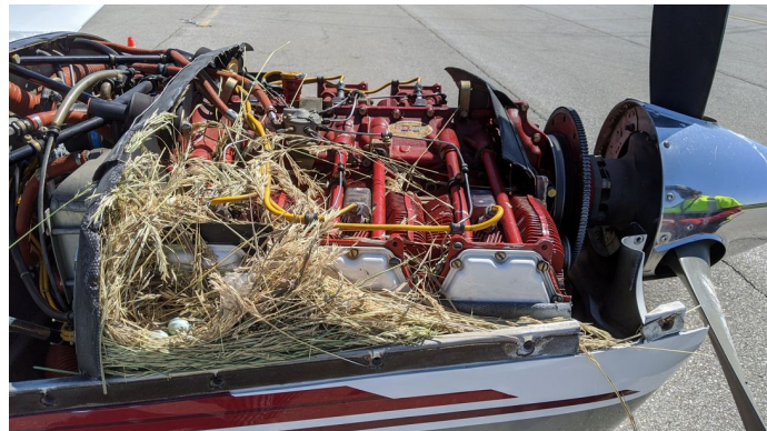
ENGINE PLUGS PREVENT BIRD NEST FOD. Piper Saratoga Engine Cowling Bird's Nest