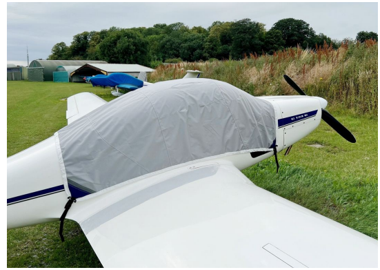
Grob 109 Travel Cover, Light Weight Canopy Cover