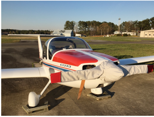
Grob 109 Prop Cover