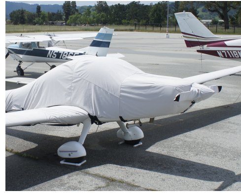
Grob 109 Prop Cover