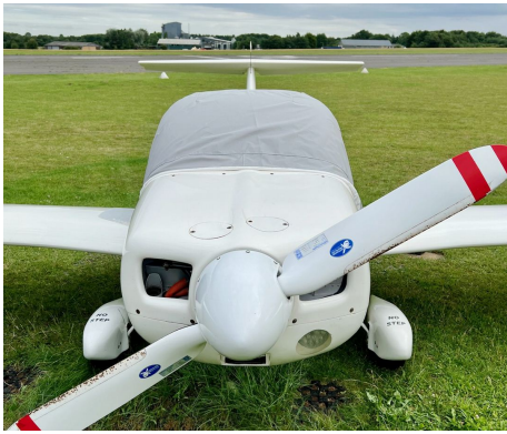
Grob 109 Travel Cover, Light Weight Canopy Cover