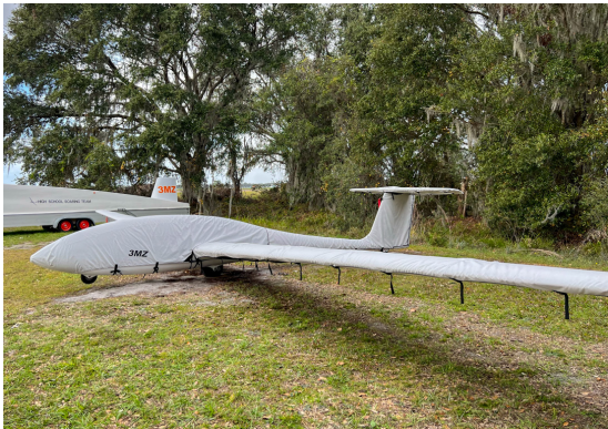
Burkhart Grob G 103 TWIN II Complete Cover Set

WINTER USE MATERIAL - Made with Solution-Dyed Polyester fabric, this option is intended for seasonal use to aid in deicing, rain mitigation, or for occasional travel. The material is lighter and more compact, but more susceptible to UV damage and may have a shorter useful life if used continuously outside than the all-year use material.