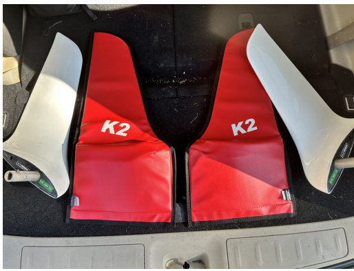
Discus CS Wingtip Pads (Set of 2)