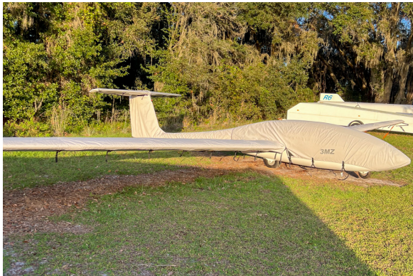
Burkhart Grob G 103 TWIN II Canopy/Nose Cover (overlaps with empennage cover) all year use

This cover type is made from Silver Acrylic Sunbrella canvas and is 100% lined with a soft and smooth microfiber. Bruce's Custom Covers developed this material combination especially for aircraft protection. The outer material is medium weight and treated for water resistance, UV resistance and anti-static buildup. The inner lining is a very soft and smooth microfiber to prevent scratching. The material is very reflective, and tests show that the cabin interior temperature can be reduced to near-ambient temperature on the hottest of days. It is water, ice and snow repellent, yet breathable to allow moisture to escape from between the cover and the aircraft surface.