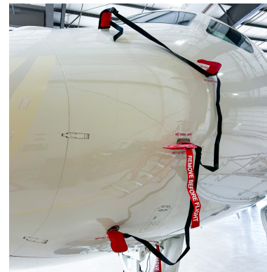
Gulfstream GVII Pitot Probes/TAT/Ice Detector Set, Heat Resistant Type