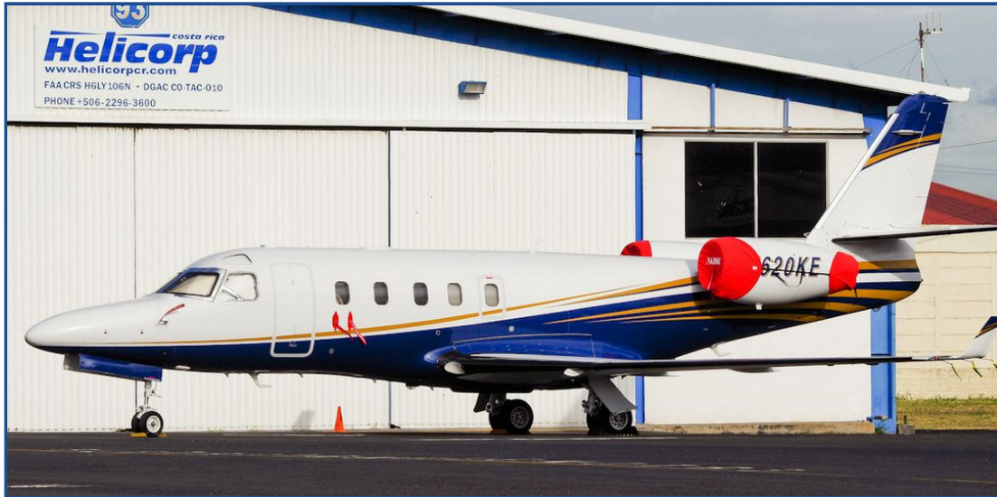
Gulfstream G100 Engine Covers with TR's and imprint