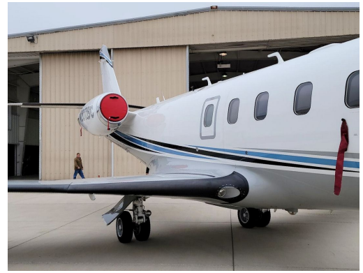
Gulfstream G100 Intake Plugs