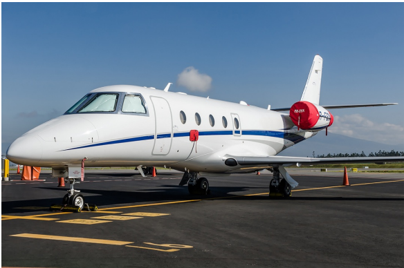
Gulfstream G150 Engine Covers, Cockpit HeatShields

Windshield Heatshields are interior sunshades for an aircraft's front windshield. The product is a unique composite of closed-cell foam with a silver mylar finish. The semi-rigid design is stiff enough to stand along the inside of the windshield using sun visors or window framing. It folds up flat and easily stores in the included storage sleeve. Some designs may require velcro and suction cups. Our Heatshields are offered white side out since aircraft manufacturers have issued advisories against reflective window inserts due to potential heat damage. A Heatshield is an excellent short-term remedy for cockpit overheating, but an external fabric cover is more effective for long-term protection.