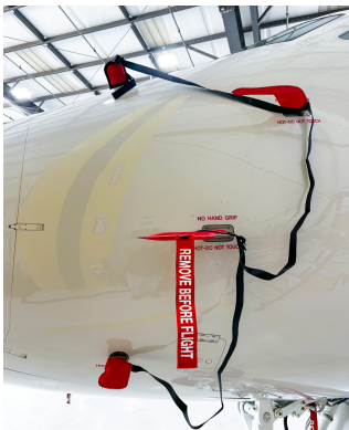
Gulfstream GVII Pitot Probes/TAT/Ice Detector Set, Heat Resistant Type

Gulfstream Aerospace Gulfstream G100 Heat Resistant Pitot Tube Covers are made of Naugahyde vinyl, and lined with a non-burning material. They are designed to cover the entire pitot assembly, slipping over the tube and tightening around the base with a Velcro strap detail. A "Remove Before Flight" streamer is attached to the cover. Heat Resistant Pitot Covers are an upgrade to our standard design, and help prevent the pitot cover from melting onto the tube if the pitot heat is accidentally turned on while installed. If you want the set tethered together, please let us know.